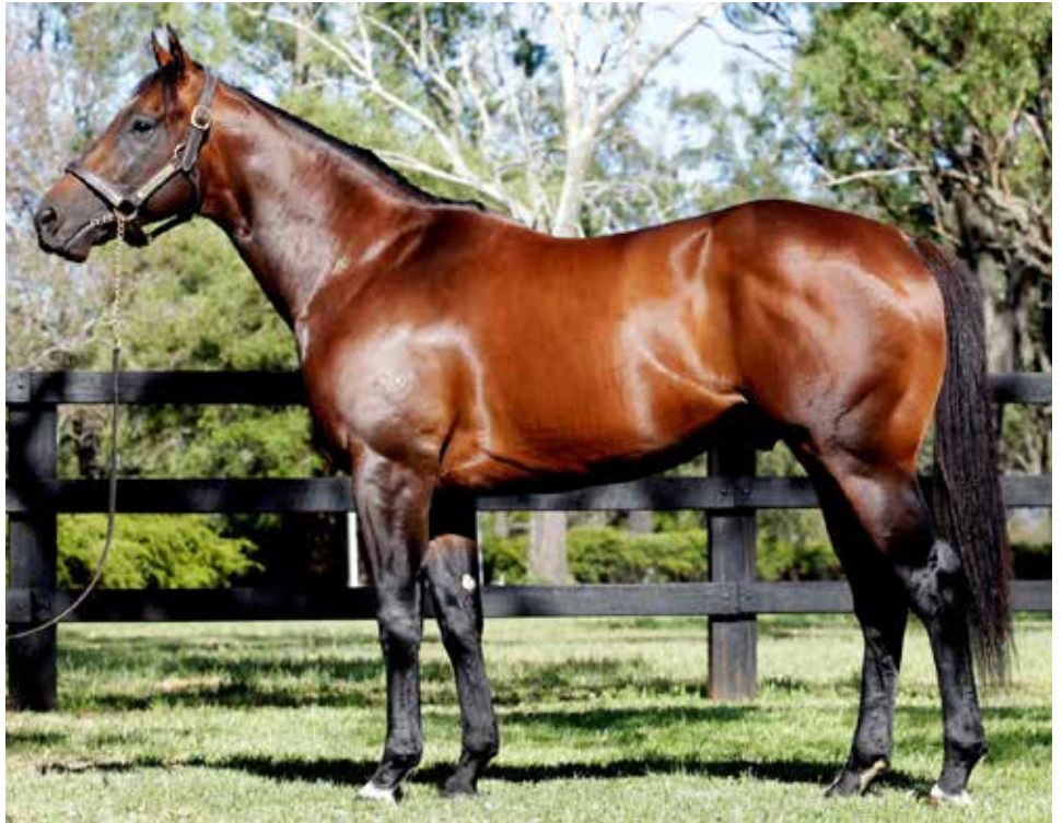
Sire of Volpe Veloce, Foxwedge