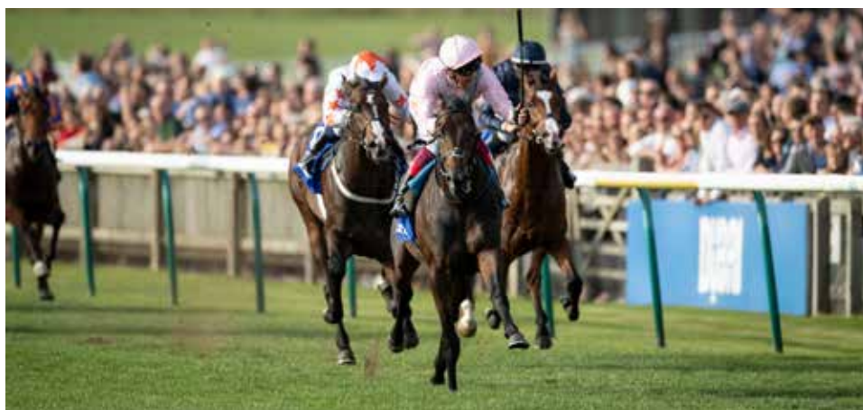
Too Darn Hot

"She has started cantering again. We are hopeful she will be running in something like the Coronation Cup at Epsom. There wouldn't be any point in starting her earlier than June – if you want to get to the Arc, you don't want to be starting in the middle of April and there aren't really the races for those older horses. She's in great order and we're very pleased with her – she's even bigger and stronger again."