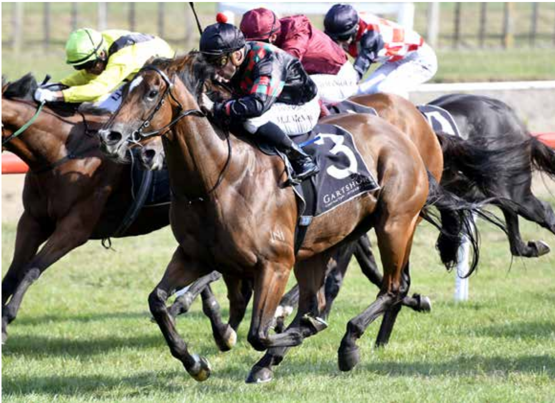
Volpe Veloce storms to victory at Tauranga