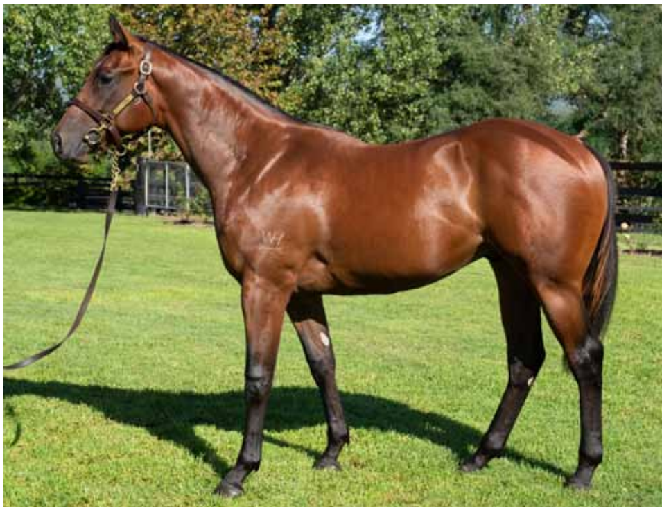
Exceed And Excel - Written Dash colt

"This horse has done incredibly well on the back of a single preparation. He did a ligament early so he came into this campaign