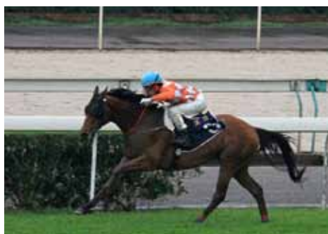
Luen On Treasure