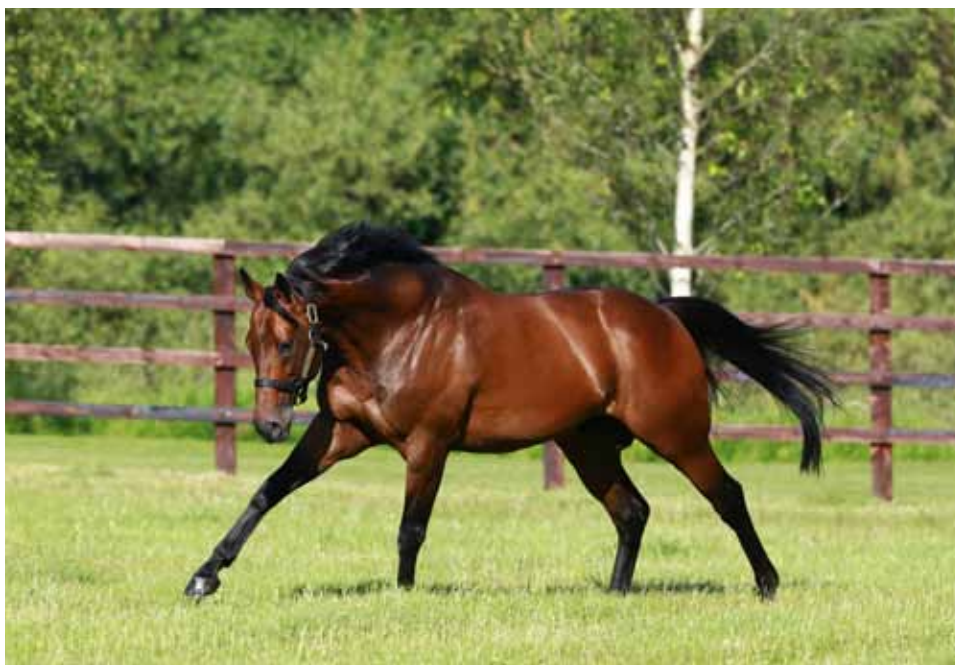
Sea The Stars