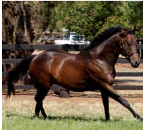
I Am Invincible

Farhh - Elegiac (4 c ex Lamentation by Singspiel) became the fourth stakes winner