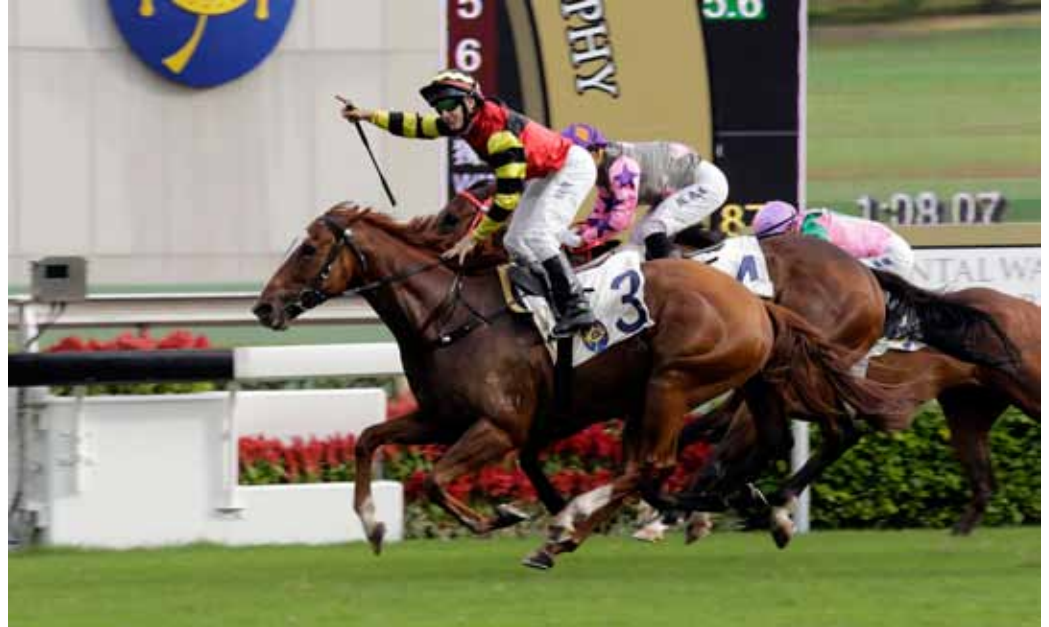
Evergreen Stud is set to sell the sister to Hong Kong winner Lucky Bubbles at Inglis Easter Yearling Sale