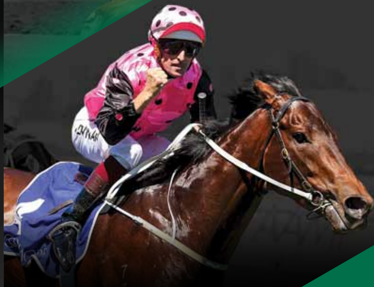
FLYING ARTIE $50,000