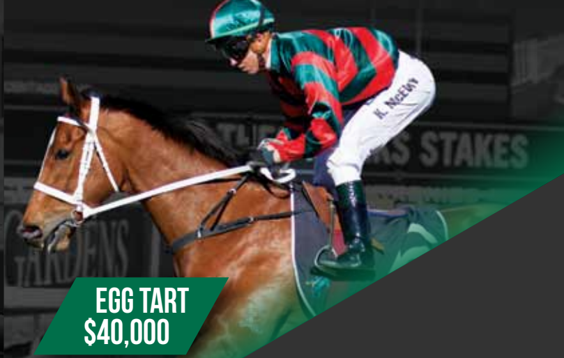
EGG TART $40,000