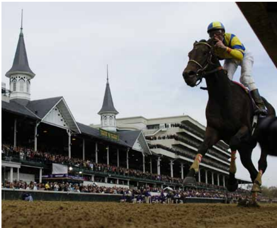
Street Sense during his racing days