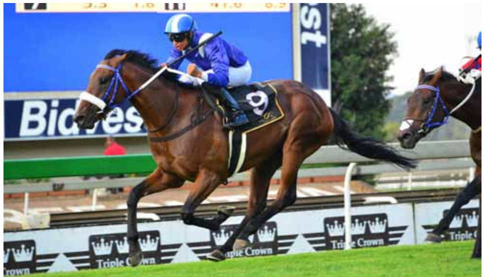
Soqrat wins the Group 1 Horse Chestnut Stakes at Turffontein

"Going forward, the weight for age races will be the most suitable, so we'll discuss a program with Shadwell Stud and Angus Gold and probably look at races like the Rising Sun over 1600m and then the Champions Cup over