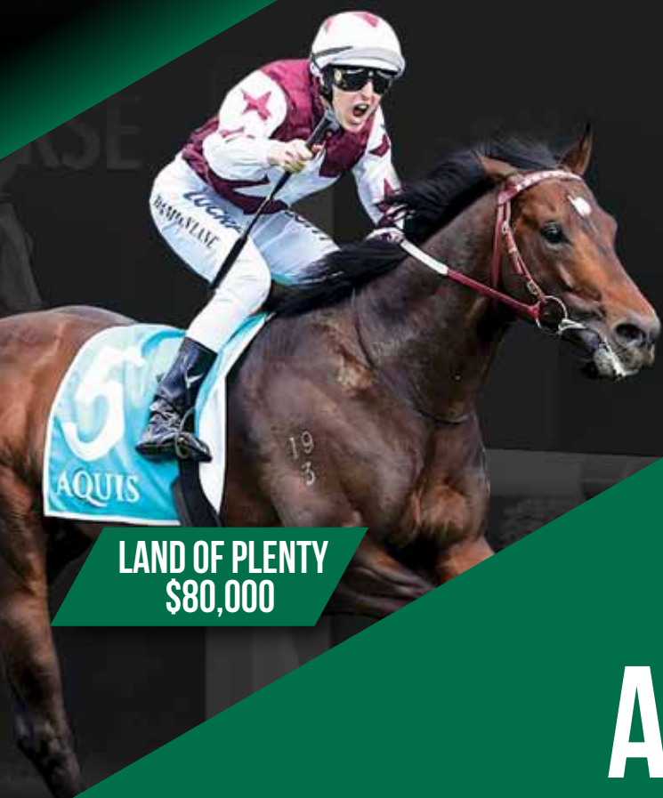
LAND OF PLENTY $80,000