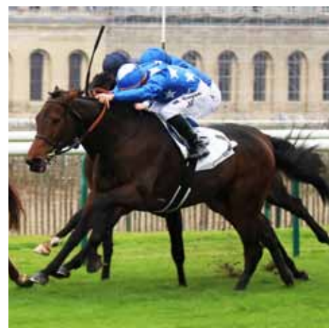
Called To The Bar

agonising second to that rival in the Prix Royal Oak (Gr 1, 3000m) back in October, but took advantage of a pull in the weights to reverse the form and score by a neck, with three lengths back to Mahoe (Doctor Dino) in third. Called To The Bar is one of 22 stakes winners for former Coolmore shuttler Henrythenavigator (Kingmambo).