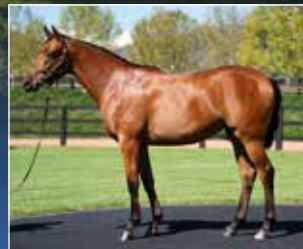
Lot 172 b f Pride of Dubai