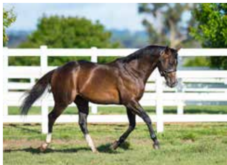
Cable Bay WOODSIDE PARK STUD