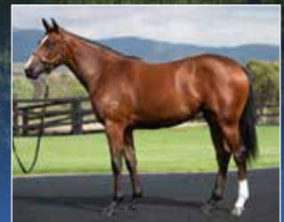
Lot 177 b f Fastnet Rock