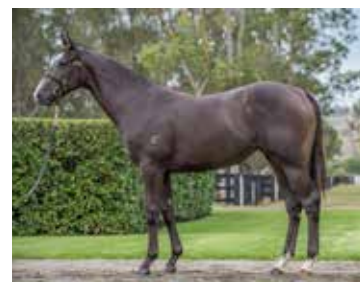
Lot 398 Pierro - Cats Whisker filly

There is no better place that Catalina's at Rose Bay for lunch on a sunny afternoon.