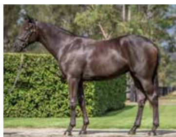
Lot 355 Pierro - Allez France filly

A few years ago at Easter we sold a Pierro (Lonhro) filly, later named Pinot, who went on to win the VRC Oaks (Gr 1, 2500m). This year we offer