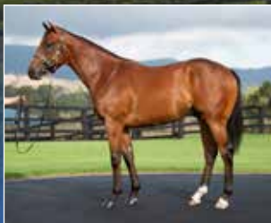
Lot 69 b c Not a Single Doubt