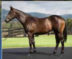
Lot 164 br f Hinchinbrook