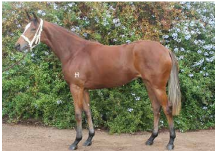
Lot 70 Dundee - My Holiday filly