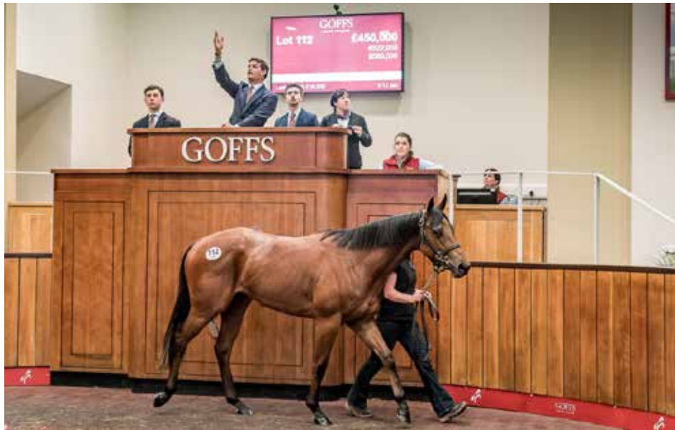
Lot 112 Siyouni - Fig Roll filly