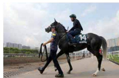
Win Bright HKJC