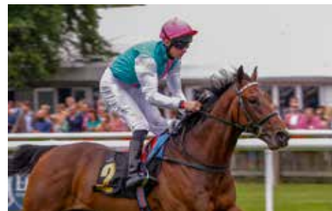
Calyx