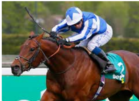
Bangkok