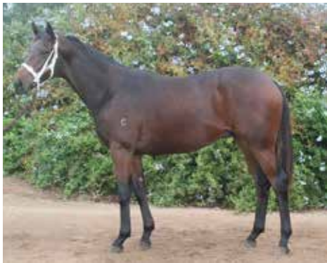
Lot 68 So You Think - Money Tree colt INGLIS

Branthwaite also believes the level of interest in the past two days during inspections at the Oaklands Junction complex has him feeling