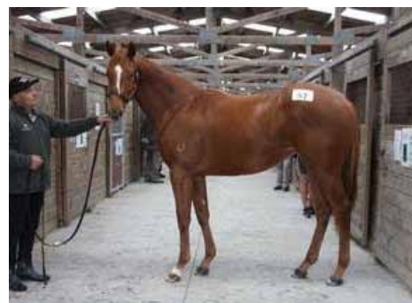
Lot 57 Per Incanto - Cherry Creek filly NZB

Southern vendor White Robe Lodge enjoyed another red-letter day at the NZB South Island Sale yesterday, selling a daughter of Per Incanto (Street Cry) for the auction-topping price of NZ$72,500.