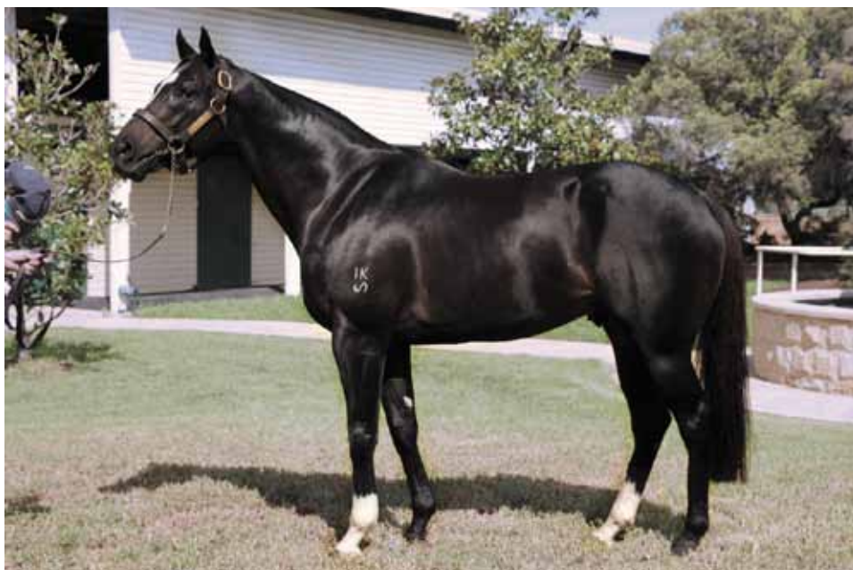
Better Than Ready