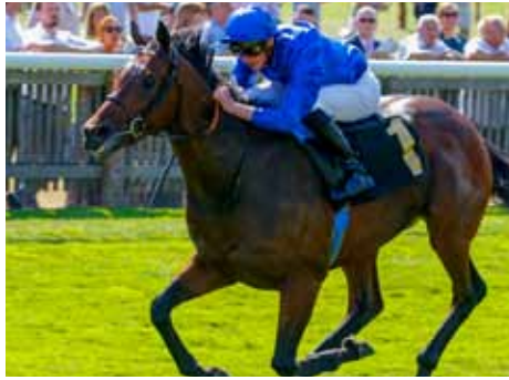
Al Hilalee