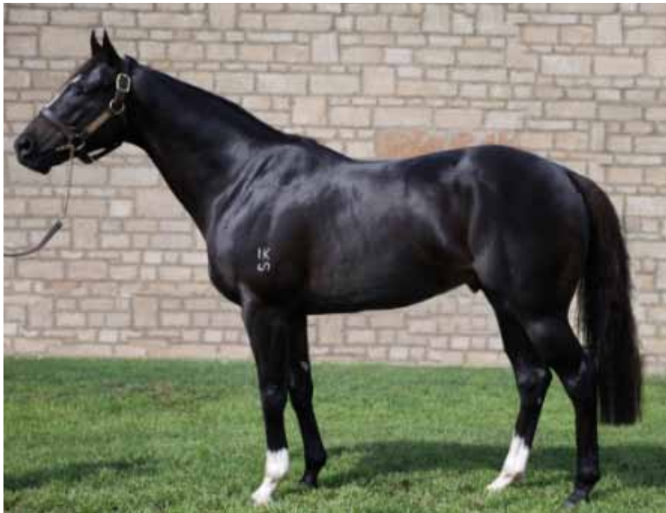
Better Than Ready