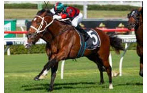
The Autumn Sun