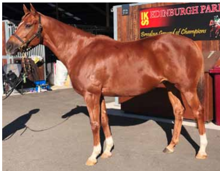
Lot 545 - Diamond Earth