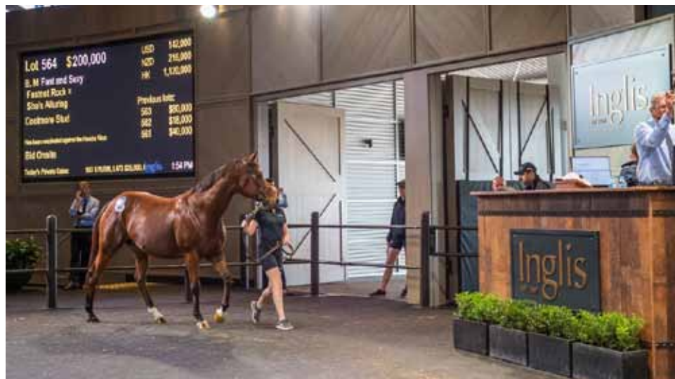
Lot 564 - Fast And Sexy

New date underpins improved results as key metrics up on 2018