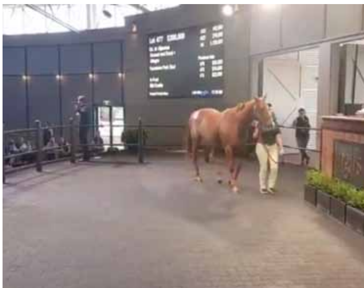
Lot 477 - Aljawzaa

Purchased from Godolphin in 2017, Twin Hills Stud is this year standing Smart Missile (Fastnet Rock), Odyssey Moon (Snitzel)