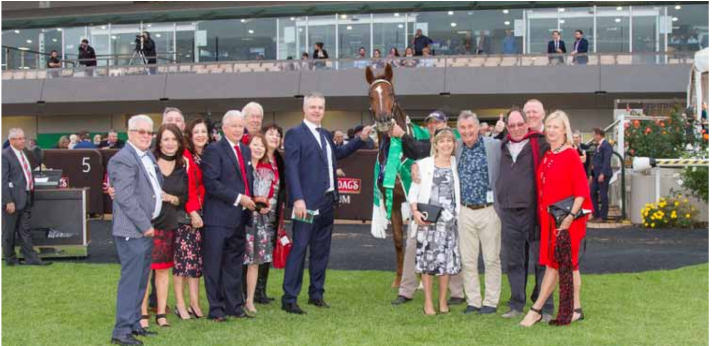
Connections of Valour Road