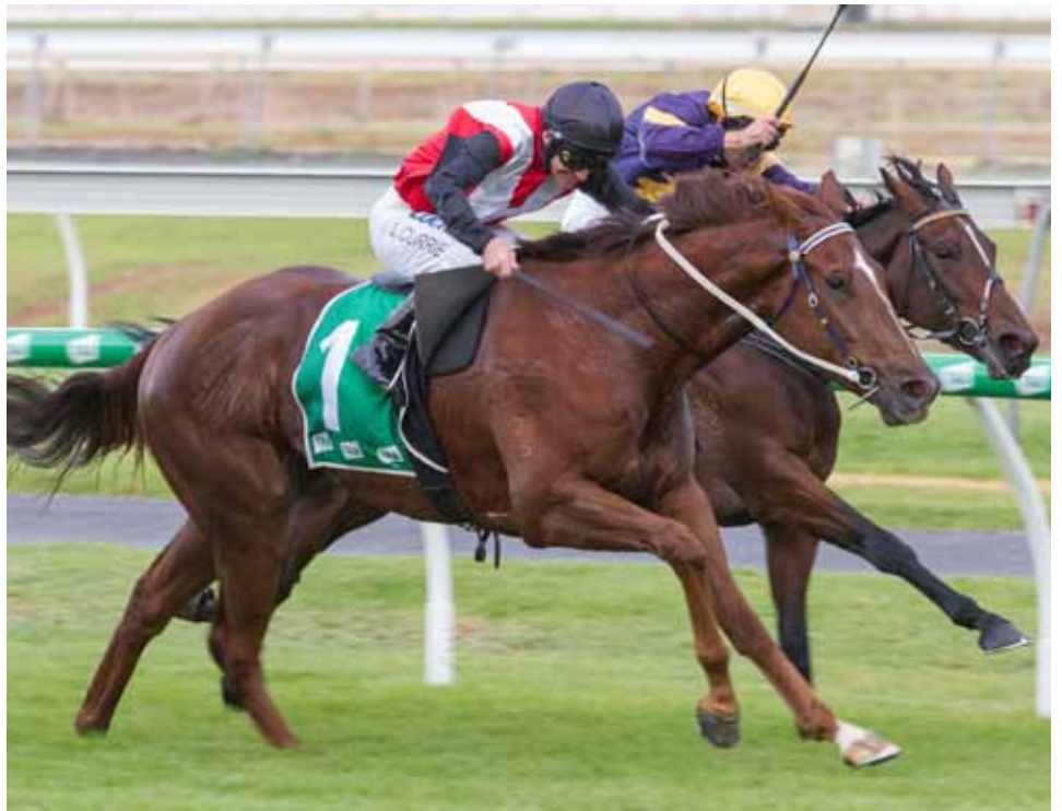
Valour Road charges home to win the Group Two Euclase Stakes

In 1997, Sayers purchased Yarradale Stud – 40 minutes north east of Perth – and has owned as many as 200 broodmares and had shares in 10 stallions. However, he has scaled back in