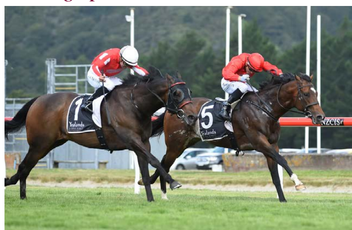
Enzo's Lad (left)