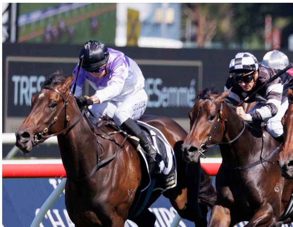
Tiz Invincible (left)

Talented daughter of I Am Invincible to take on seven rivals including 'underrated' stablemate Griff