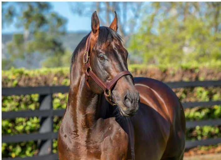
I Am Invincible