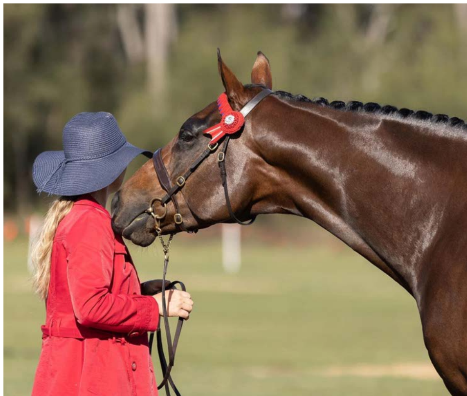
The equestrian event will have a minimum $1 million in prize-money