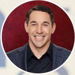
TEAM CAPTAIN Billy Slater