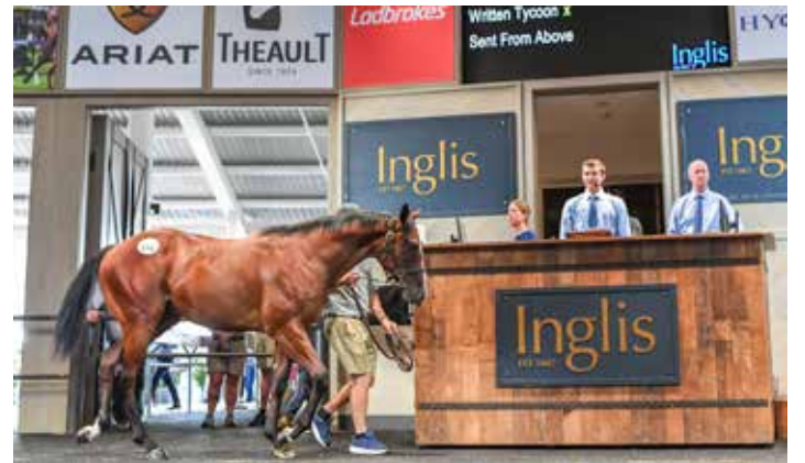
Lot 674: Written Tycoon ex Sent From Above colt INGLIS

The former managing owners of raging Golden Slipper favourite Storm Boy (Justify) wasted no time reinvesting into another colt, going to $360,000 for the Written Tycoon (Iglesia) half-brother to his stablemate and likely major rival Shangri La Express.