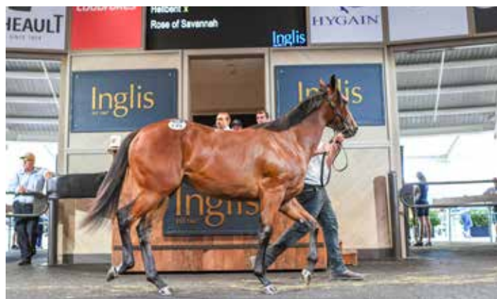
Lot 649: Hellbent ex Rose Of Savannah filly