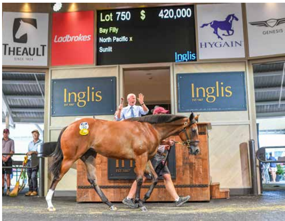
Lot 750: North Pacific ex Sunlit filly