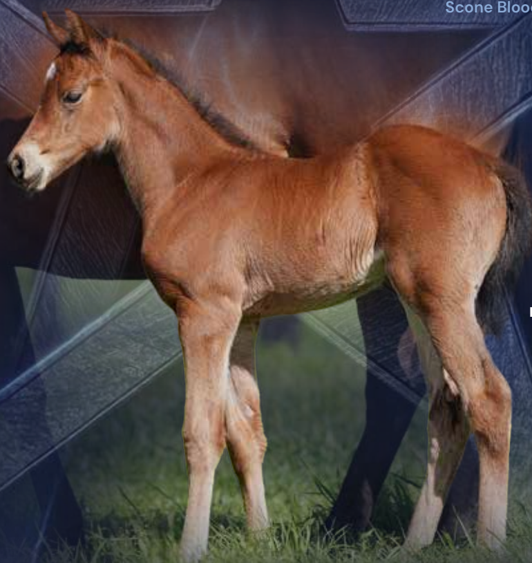
FILLY O/O LATINO BLEND (NZ) BRED BY GEOFF WILSON