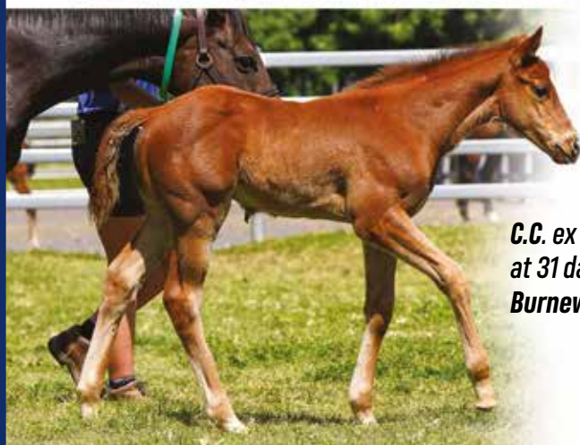
C.C. ex JE SUIS BELLE at 31 days. Bred by Burnewang North