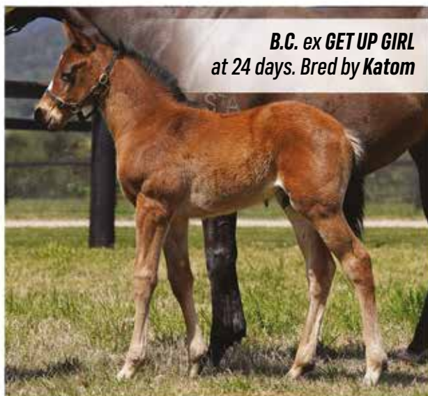
B.C. ex GET UP GIRL at 24 days. Bred by Katom