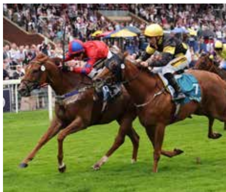
Alzahir (red and blue silks)