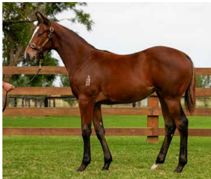
Face The Wild pictured as a weanling

Out of star mare Ennis Hill (Fastnet Rock), who was also trained by the Hayes camp, the