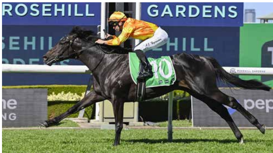
Shangri La Boy

Pelican has a two year-old filly by Coolmore shuttler St Mark's Basilica (Siyouni), a yearling filly by former shuttler Justify (Scat Daddy) and was covered last spring by the late Wootton Bassett (Ifraaj).