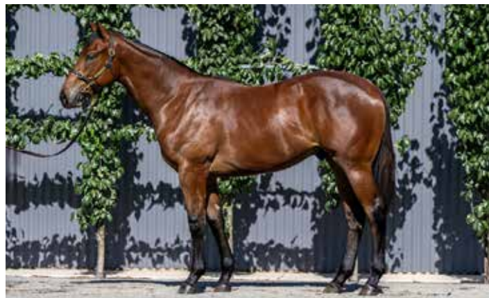
Commit pictured as a yearling

"We raced Mum, she was our first genuine, stakes-quality horse in our very early days. She won consecutive races down the straight at Flemington ... Face Forward was our first proper stakes horse, even though she didn't win a stakes race, she did run fifth in a Listed race at Flemington, but she carried 60 kilos that day and got beat by a boy, carrying 56 [kilograms].