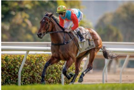
Ka Ying Rising