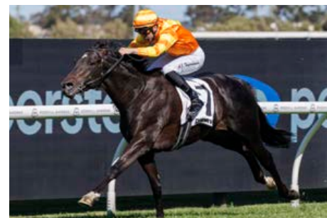
Shangri La Boy