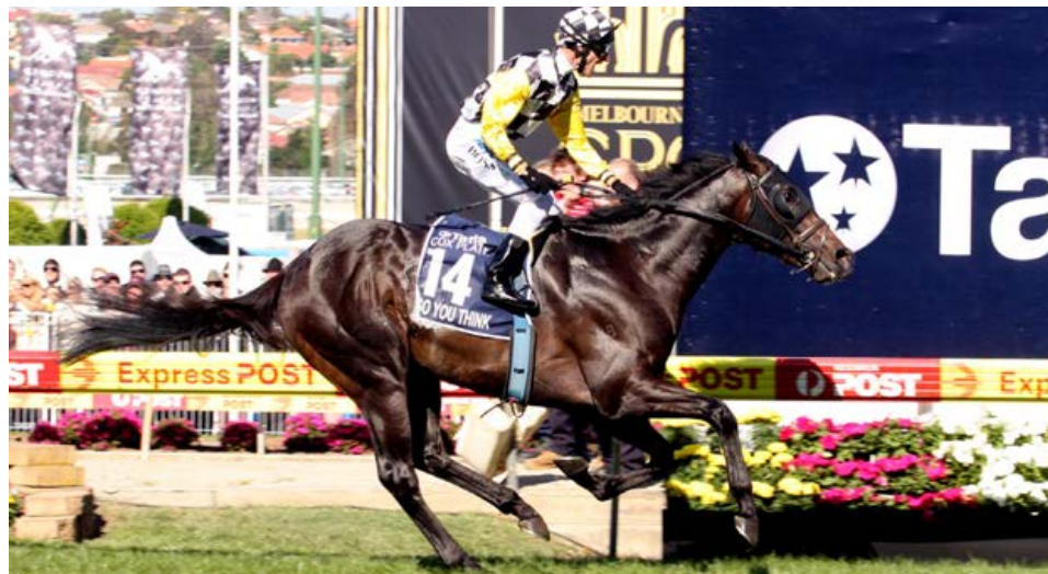
So You Think winning the Cox Plate in 2009