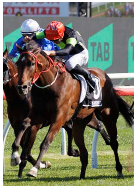
Think About It winning the Everest

The stallion's daughters are ensuring his influence on both sides of the pedigree. So You Think mares have produced eight stakes winners, headed by Golden Slipper (Gr 1, 1200m) and Sires' Produce Stakes (Gr 1, 1400m) winner Fireburn (Rebel Dane) and Prix Jean Prat (Gr 1, 1400m) winner Puchkine (Starspangledbanner).