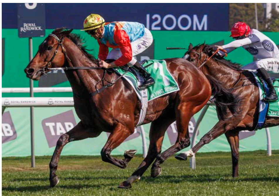
Ka Ying Rising

Ah yes, the Melbourne Cup, the race which was so popular the state of Victoria chose to make the first Tuesday in November a public