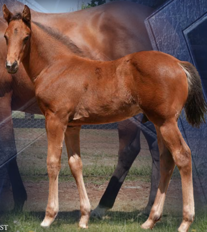
COLT O/O RUUD AWAKENING