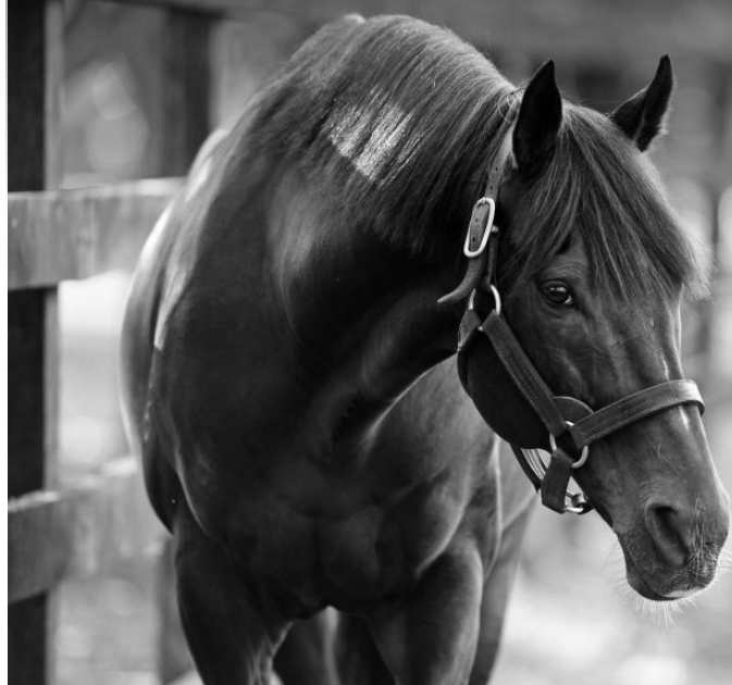
So You Think