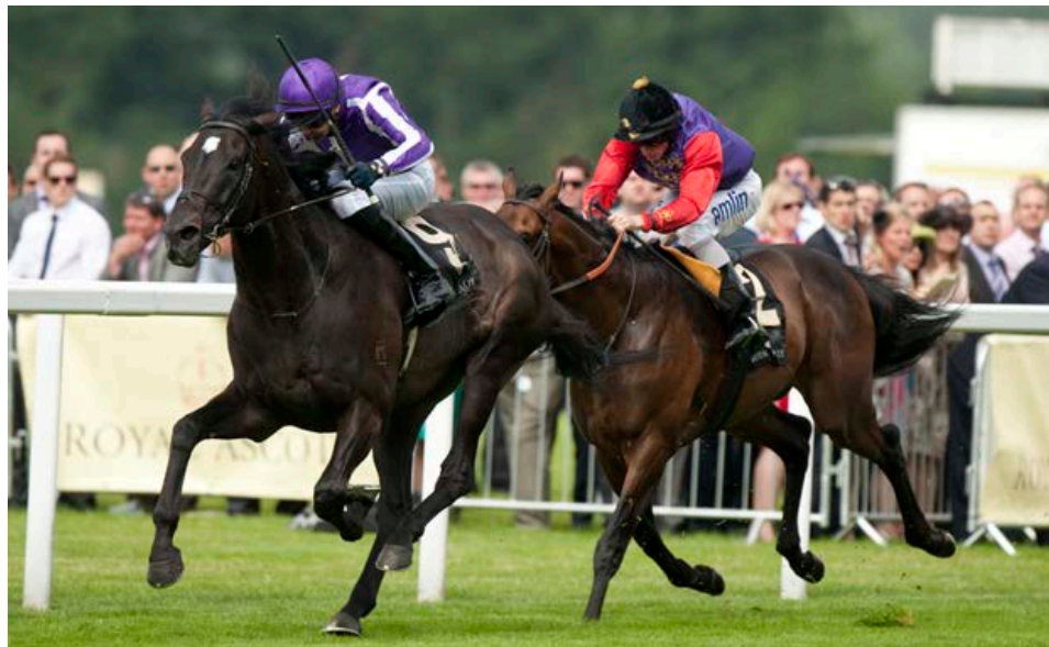
So You Think winning the Prince Of Wales's Stakes