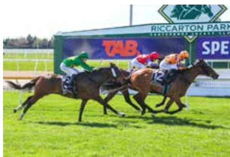
Captured By Love