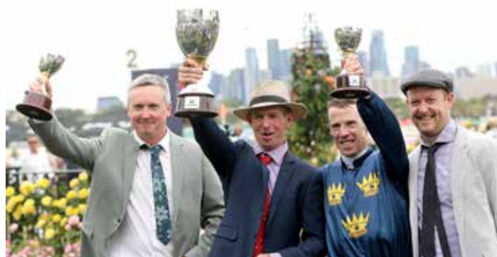
Strictly Business connections

"Unreal, and I've got a suspension to start off with today, so I'm going to have plenty of time to celebrate!"