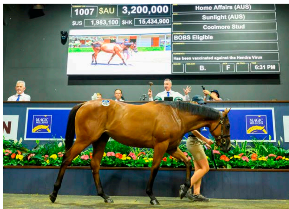
The Home Affairs filly out of Sunlight topped this year's edition of the sale at $3.2 million

CRAWFORD, TEETAN COMBINE FOR EMOTIONAL G3 SA SA LADIES' PURSE TRIUMPH Page 10