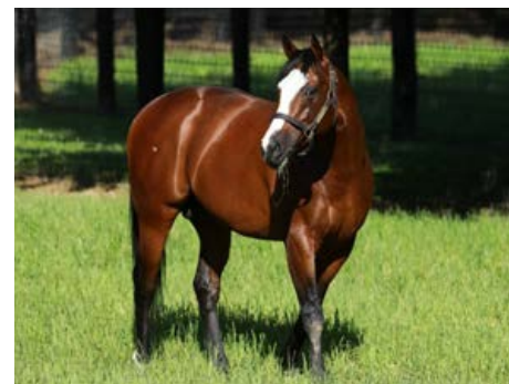
Tiz The Law