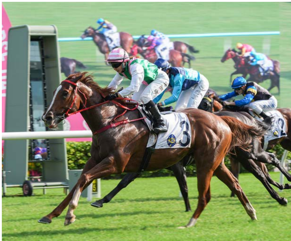
Circuit Grand Slam

“It was good that we could just jump neutral and we didn’t have to be up the front,