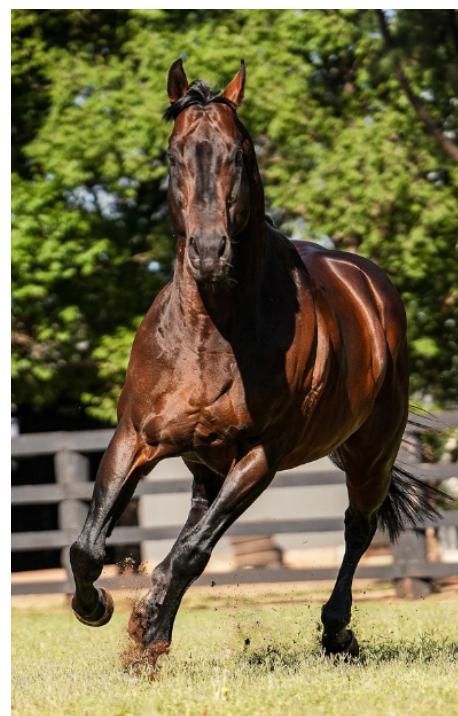
I Am Invincible

Among the 41 offerings from the late Snitzel's penultimate crop are close relatives to a trio of Group 1 winners: a three-quarter sister to Qafila as Lot 11 , a half-sister to Prince