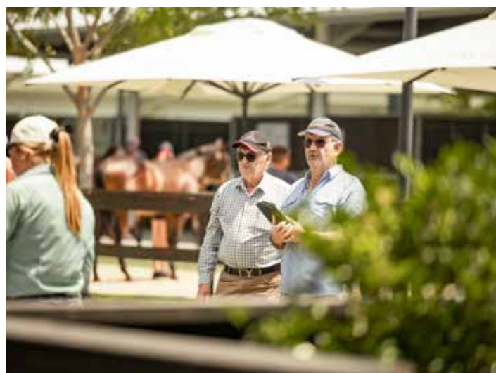
Inglis Classic inspections

anticipated sire Pinatubo (Shamardal) - whose oldest progeny are just hitting the tracks - has 18 yearlings at the sale. They include Lot 178 , Yarraman Park's daughter of Meliora (Ad Valorem), winner of the Angus Armanasco Stakes (Gr 2, 1400m) and dam of two stakes winners in current Swettenham Stud sire I Am