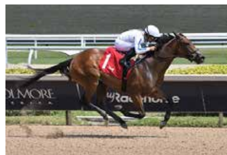
Shred The Gnar