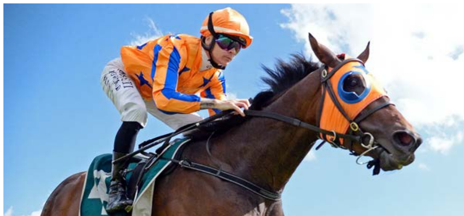
Qali Al Farrasha

She doesn't win out of turn and the Breeders' was just win three in a career of 17 starts for prize-money earnings of $586,175, a nice result for her owners, Te Akau Stud, and Westonlea Stud who bred her in conjunction with Nearco Stud.