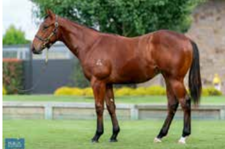
Paradoxium pictured as a yearling