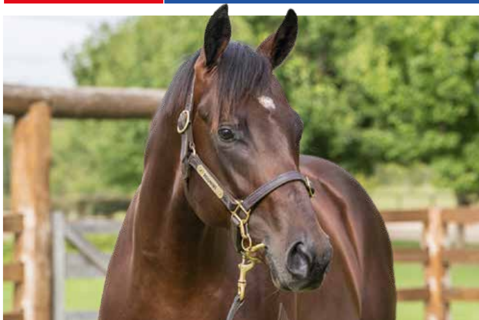
Vatican pictured as a yearling