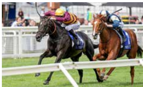
She's A Hustler