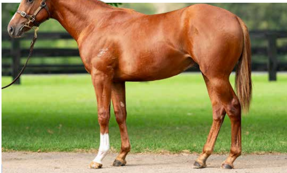
Jet pictured as a yearling

Won: Brave Smash @ Yarraman Park Maiden Plate, 1300m, December 17, Warwick Farm