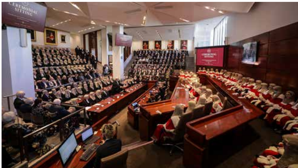
Supreme Court of New South Wales