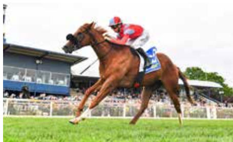
South Of India

Having landed a Benchmark 100 over 1100 metres at Ballarat last time out, Dom Sutton was not planning on dropping South Of India (Churchill) back 100 metres in trip, but with nothing more suitable on the calendar, the five-year-old gelding will be lining up at Caulfield