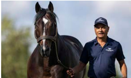
Shalaa WOODSIDE PARK STUD