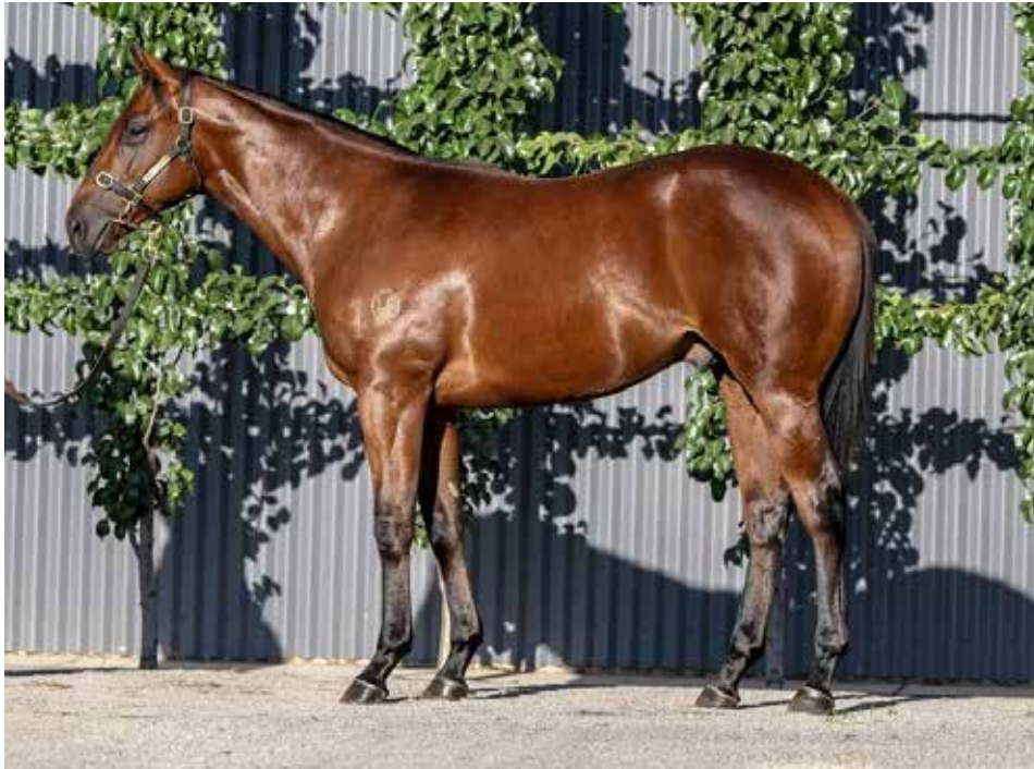
Knightsbridge pictured as a yearling