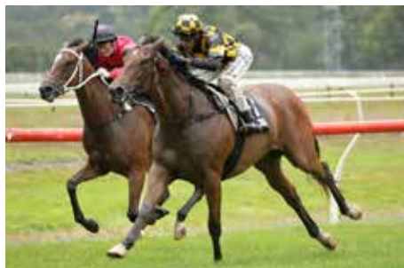
State The Obvious