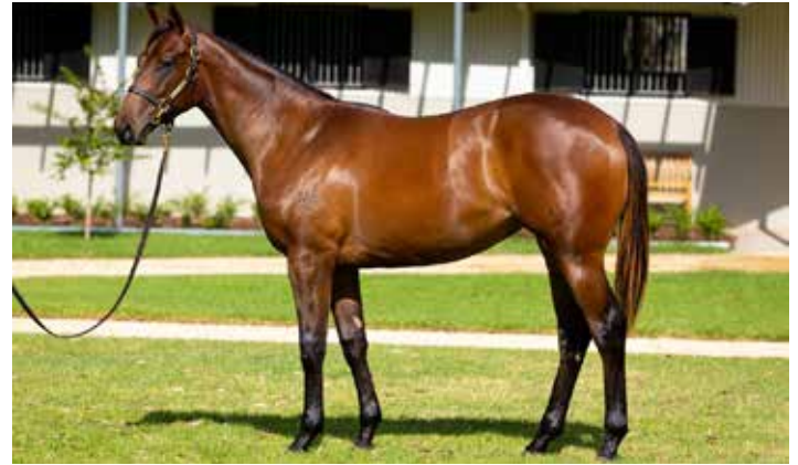
Lot 235: Farnan ex Ducale filly