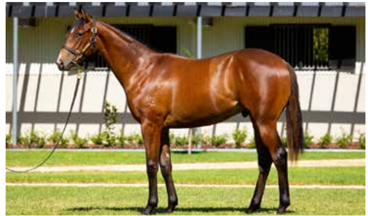
Lot 786: Farnan ex Serious Satire colt