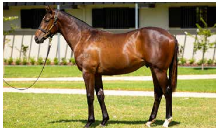
Lot 358: Farnan ex Huboor colt

"These sorts of results show what we're trying to produce, not only with our own brand with our stallions as well, we're trying to get the end result and it's very important to us to deliver for anyone that supports us in the stallion barn or in the ring."