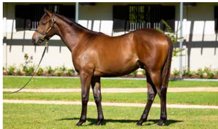
Lot 873: Farnan ex Summer Fun colt