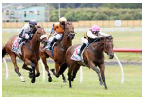
Sweetest Thing (outside)