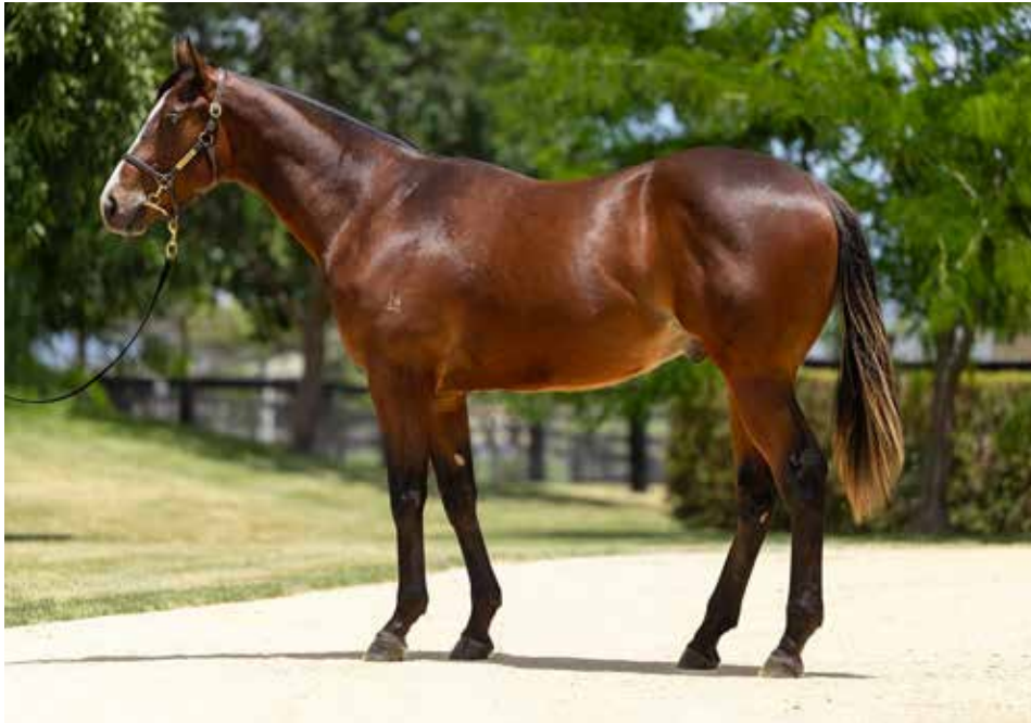
Snitzel ex Fashion Faux Pas colt topped Newgate's draft at last year's MM sale