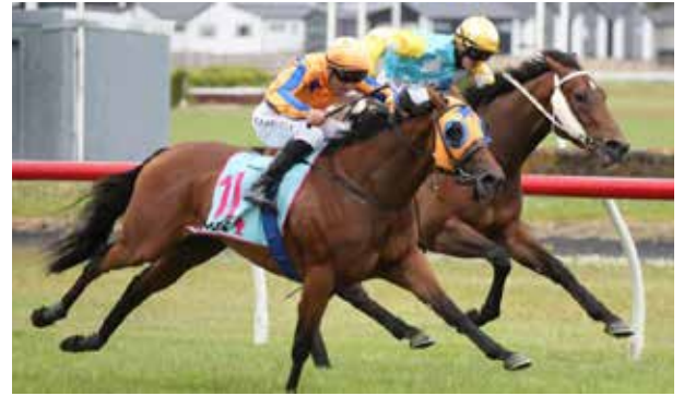
La Dorada winning the Levin Classic

A brief rest, some home cooking and she returned in December, fronting at Te Rapa against three-year-olds in the Wentwood Grange 1200 to finish an encouraging fourth, not too far from the winner. That brought her along in good style for the Levin Classic where she began quickly to co-lead early but soon drifted, settling midfield when they reached the first corner. The pace then slackened and she