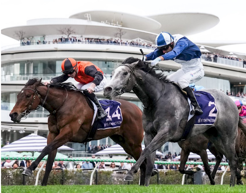
Akaysha (left) finished a narrow second behind My Gladiola at Flemington in September

IT'S IN THE BLOOD SIX OF THE BEST AT MAGICS Page 13