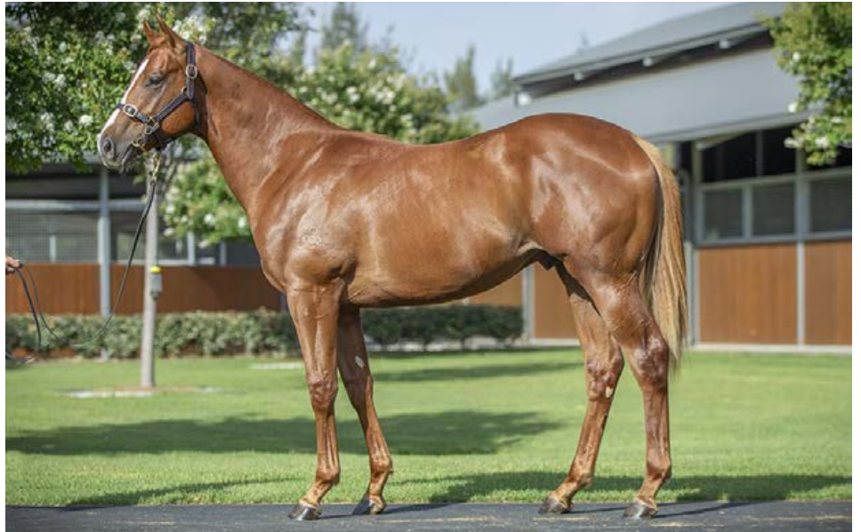
Lot 372: Snitzel ex Iffraania colt

Not only are they not making Snitzels any