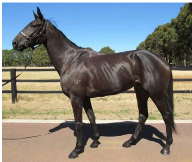
Lot 42: Twilight Tale

Entries for the next Magic Millions Digital Sale (Jan 23-28) open tomorrow. To learn more about Magic Millions Digital or to lodge an entry, click here .