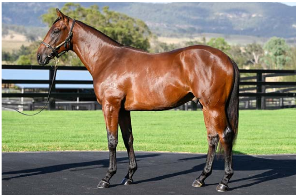
Lot 537: All Too Hard ex Mid Summer Music colt

Zoustar over Charge Forward has yielded ten winners from 11 runners including three at stakes level (27 per cent).