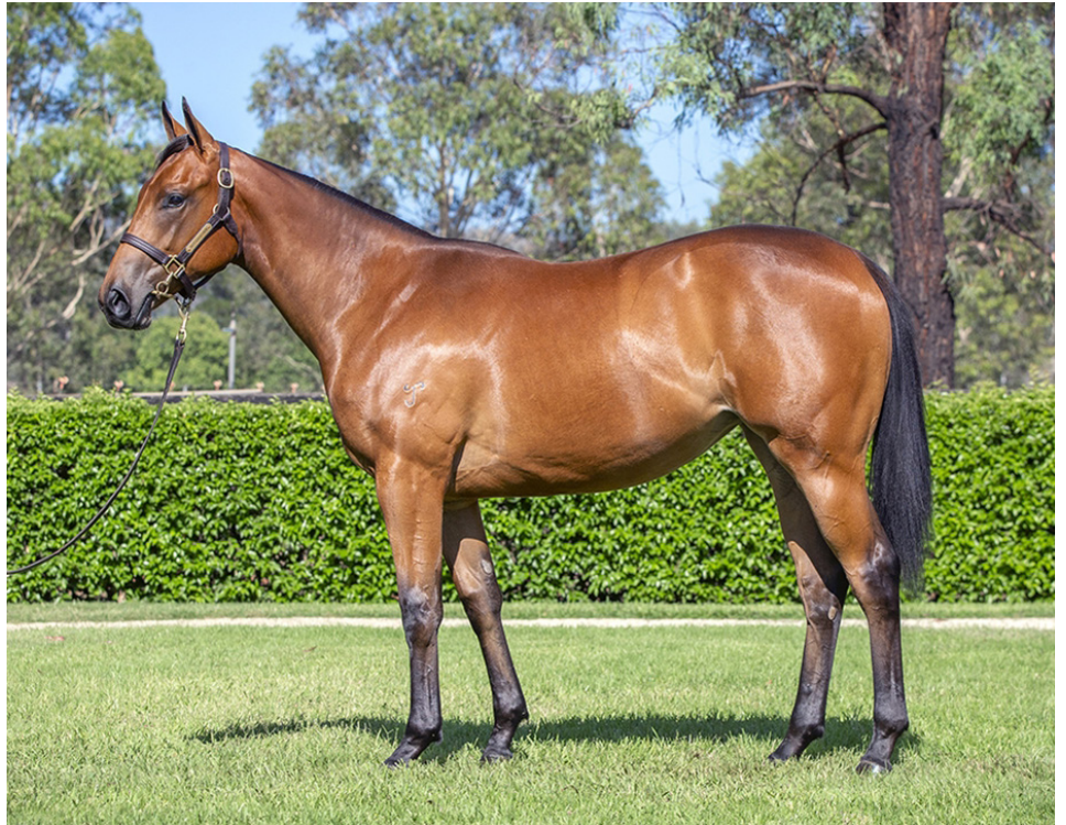
Lot 865: I Am Invincible ex Stellar Pauline filly