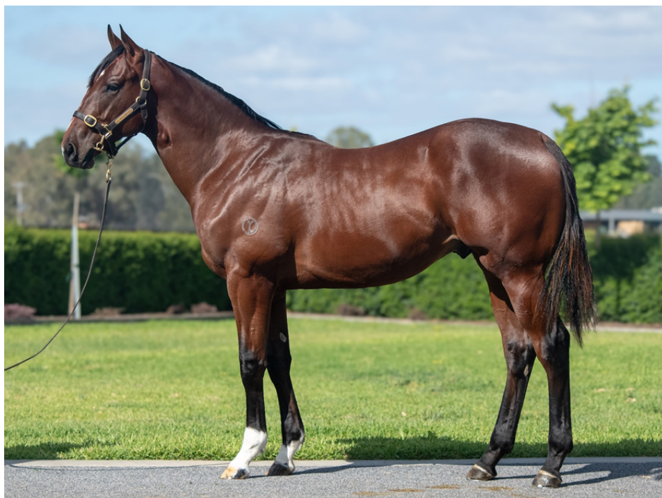
Lot 78: Written Tycoon ex Away Game colt

"He's got great muscle definition, a very balanced body, and an exceptionally strong hip with a good strong forearm. I guess he's the