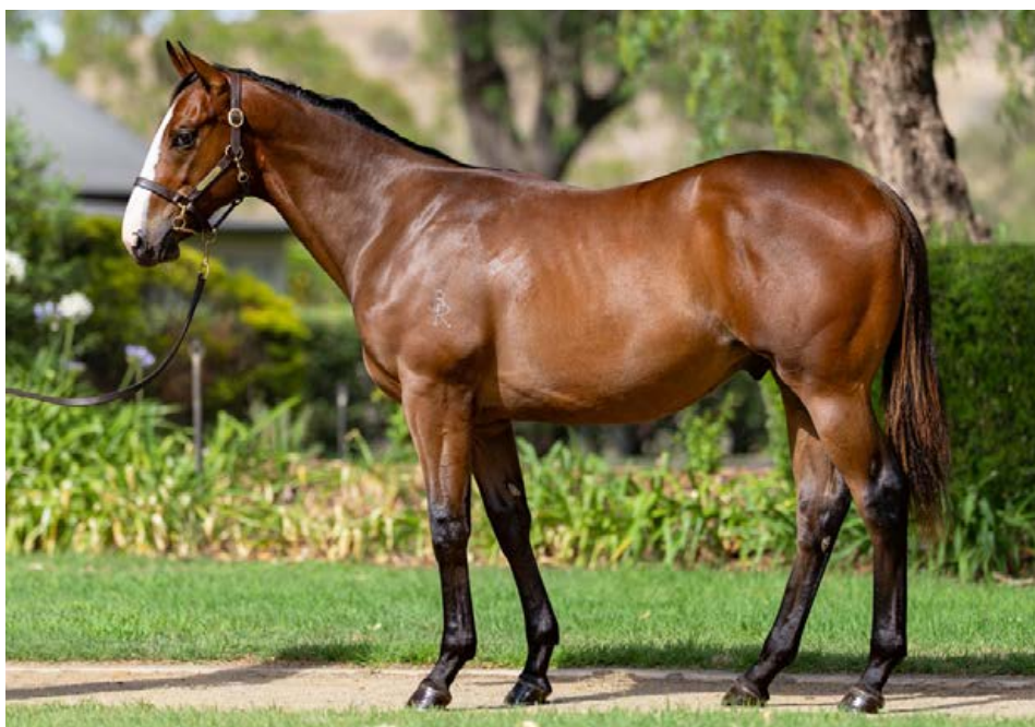
Lot 493: Snitzel ex Loving Gaby colt

He’s a brother to dual elite winner Stefi Magnetica, with the pair being by Vinery’s thoroughly proven stallion All Too Hard and out of another top-tier victor in Mid Summer Music. That mare - who died soon after this colt was born, leaving him to be foster-raised - also has the Group 3-winning Hellfest (Fastnet Rock) among her brood.