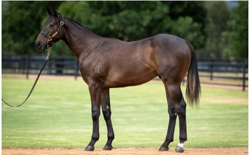
Lot 835: Zoustar ex Solar Charged colt