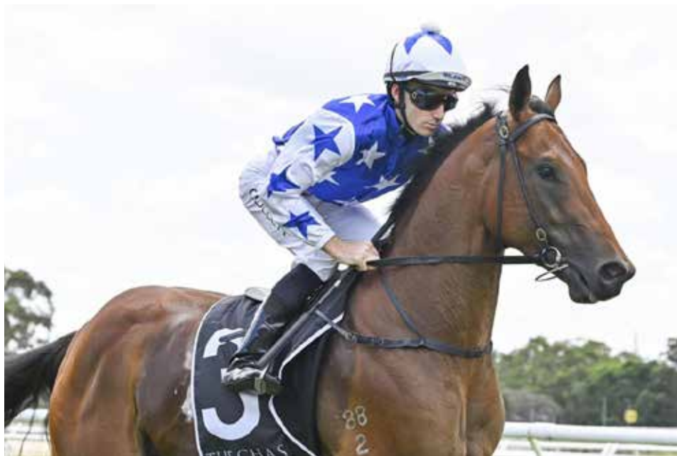
King Of Pop