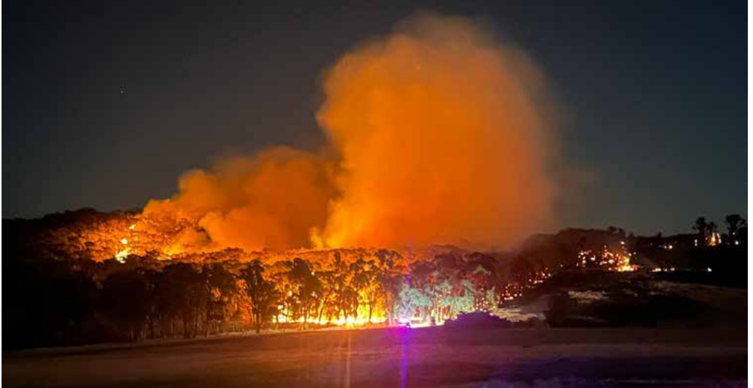
Studs and training centres have been evacuated in the Longwood area of Victoria