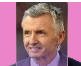
ANZNews BRUCE MCAVANEY AUSTRALIAN SPORTS BROADCASTING LEGEND

ANZ BLOODSTOCK NEWS PROVIDES FOR ME THE COMFORT OF A FAMILIAR NEWSPAPER AT THE START OF THE DAY. IT'S A SOLID MIX OF NEWS AND INFORMATION, PROVIDING CONTEXT AND BACKGROUND IN A FAST-MOVING INTERNATIONAL INDUSTRY