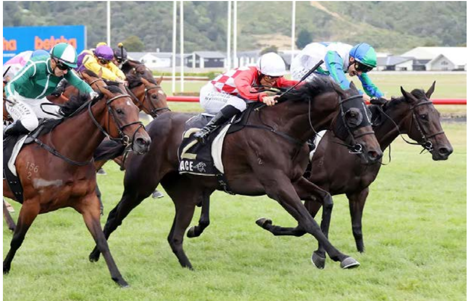
Fairy Dream (centre)

One statistic regarding the Magic Millions may give hope to those who were priced out of the market at last week's sale which saw the turnover top $200 million, surely a promising sign for Karaka. Yet again, racing, the great leveller, threw up a result which flies in the face of high-priced bloodstock when the $3