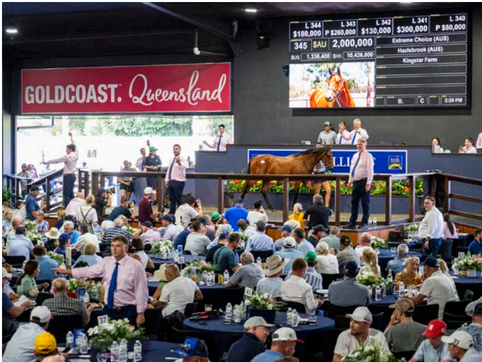
Extreme Choice and Frankel colts shared top billing at $2 million