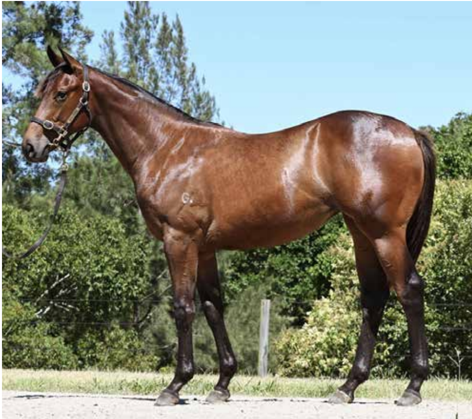
Angels Fury pictured as a yearling