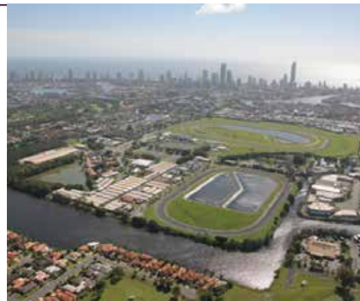
Magic Millions racetrack and sales complex MAGIC MILLIONS

Queensland sires Better Than Ready (More Than Ready) (56 lots) and Spirit of Boom (Sequalo) (26) headline the catalogue as the two most represented stallions. Other well-represented sires include Alabama Express (Redoute's Choice), All Too Hard