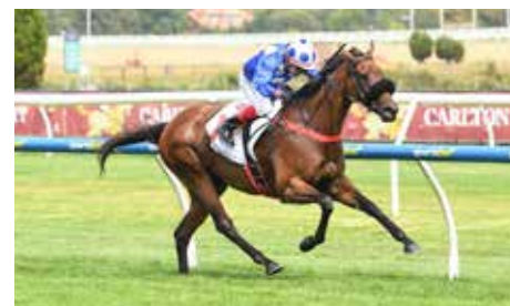
Wrote To Arataki