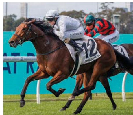
Queen Of Clubs

I don't think that's going to come until she gets to 2000 metres. I don't think she's sharp enough to win against these really good fillies like Apocalyptic, who's really sharp. She will be hard to beat right up until the mile, but from there on, the gate opens up a bit more." Queen Of Clubs showed promise during the spring in the Princess Series before pulling up with heart arrhythmia after the Flight Stakes (Gr 1, 1600m). Her best performances have come on rain-affected ground and Portelli is hoping for wet conditions later in the autumn. "If we happen to get rain when we get to our grand final period, it would certainly help," he said. "She loves it wet and the autumn is often a wet time."