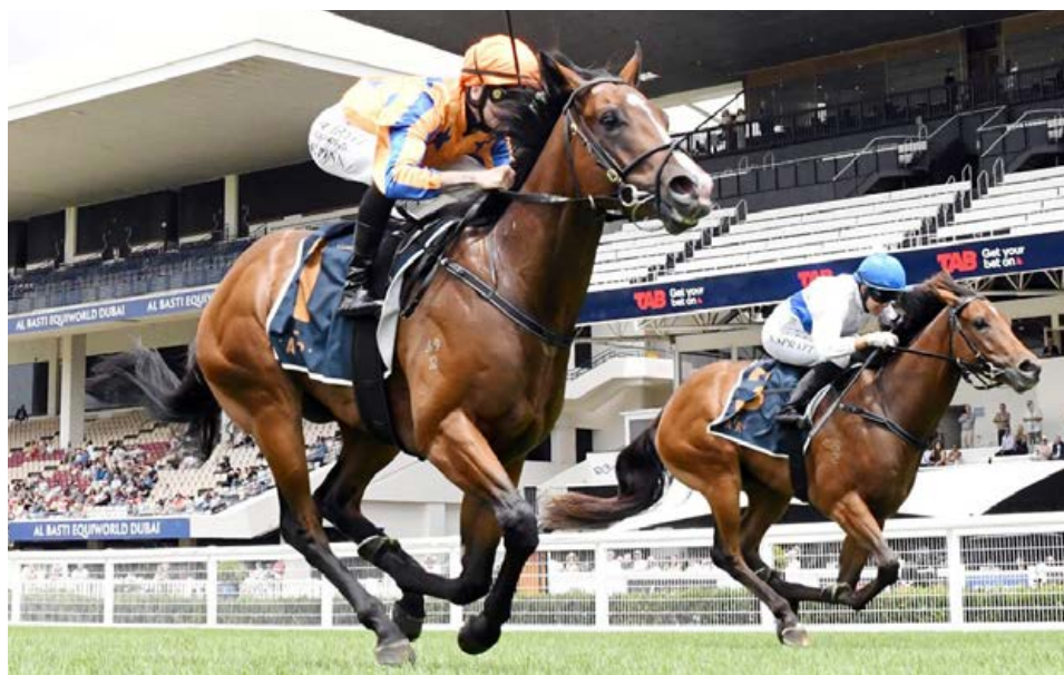
Return To Conquer