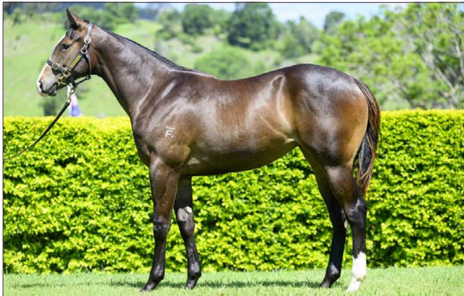
Better Off Alone pictured as a yearling