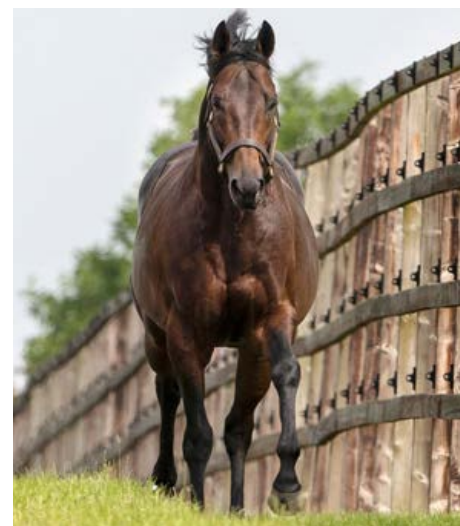
Too Darn Hot

Group 2-placed Listed winner Cathay Lady. Extensible's filly by Coolmore's US Triple Crown winner Justify (Scat Daddy) will be offered by Tyreel Stud at next month's Inglis Australian Easter Yearling Sale, catalogued as Lot 301 . Crowned Australia's first and second-season champion sire, Too Darn Hot has now produced 14 Australian stakes winners from 141 runners, operating on a remarkable 9.9 per cent stakes winners-to-runners strike rate. Having covered 110 mares at a fee of $275,000 (inc GST) at Kelvinside in the spring, the son of Dubawi (Dubai Millennium) is currently standing at Dalham Hall Stud for £100,000 (approx. AU$190,320).