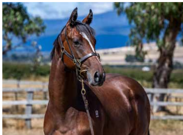
Lot 11: Rubick ex Lita colt