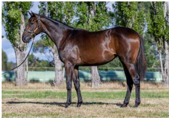
Lot 112: Needs Further ex Gold Phoenix filly

“We worked hard with the vendors to ensure they had those types of horses here for this edition.”