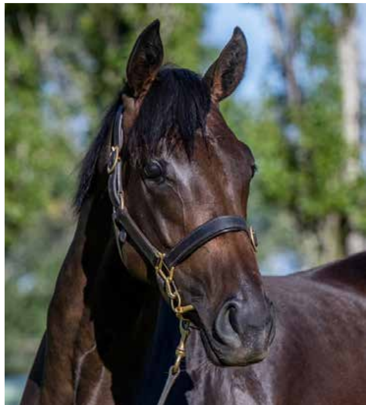
Lot 26: Needs Further ex Oh So Gold filly