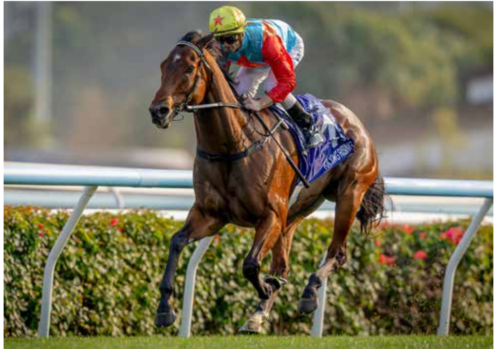
Ka Ying Rising

Silent Witness reigned from December 2002 to April 2005, snaring seven top-level