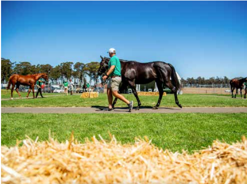
Tasmanian Yearling Sale