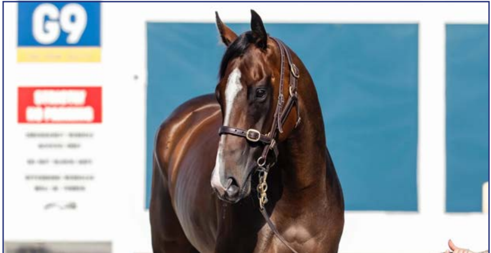
Lot 135: Manolo Bling