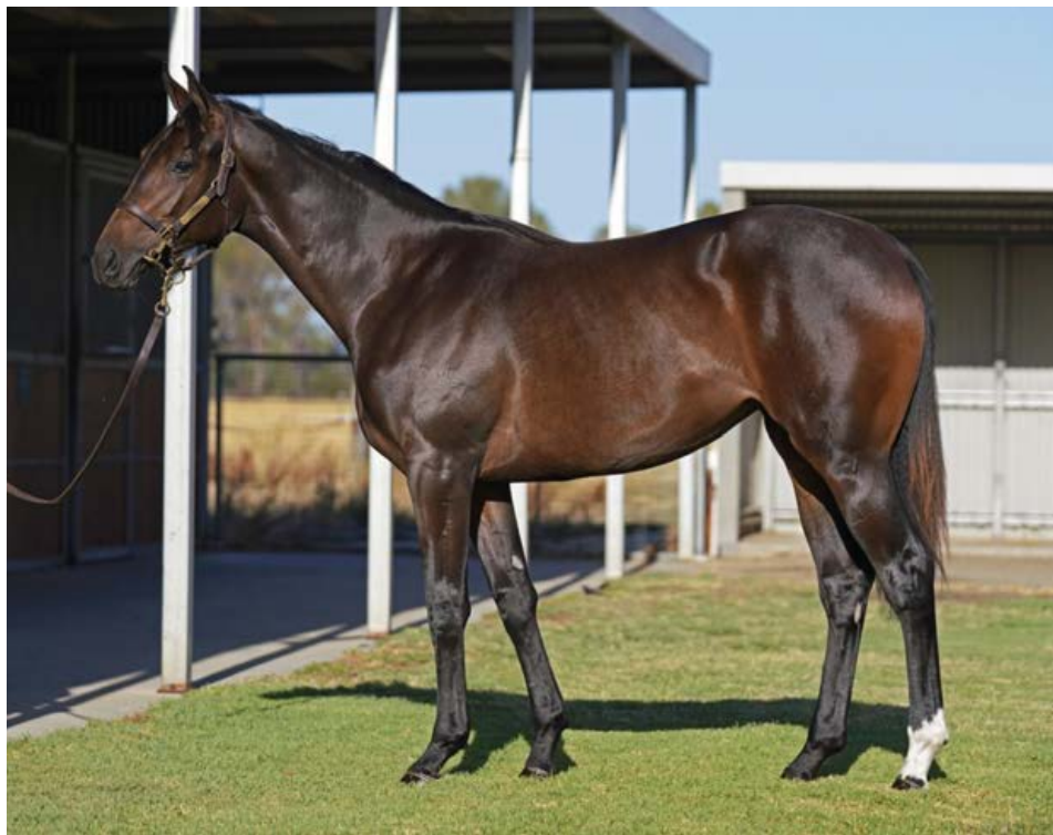
Lot 116: Ghaiyyath ex I'm Wicked filly