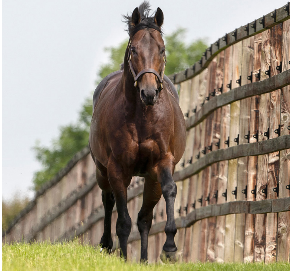
Too Darn Hot