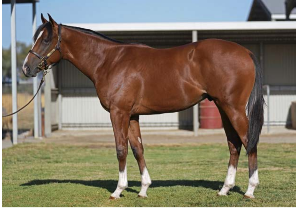
Lot 560: Wooded ex Clearwater Bay colt

Another prized lot amongst the draft is their colt (Lot 560) by Wooded (Wootton Bassett), one of Penfold's favourite sires. Penfold runs the yearling preparation business herself but still spends the breeding season at Swettenham Stud, where Wooded stands for $16.500 (inc. GST).