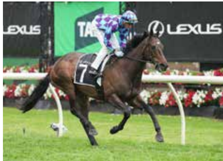
Pride Of Jenni