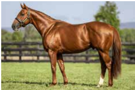
Tiger Of Malay