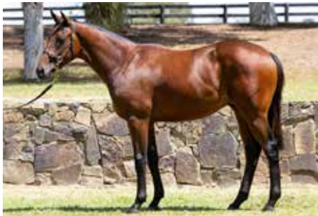
Bootlegger pictured as a yearling