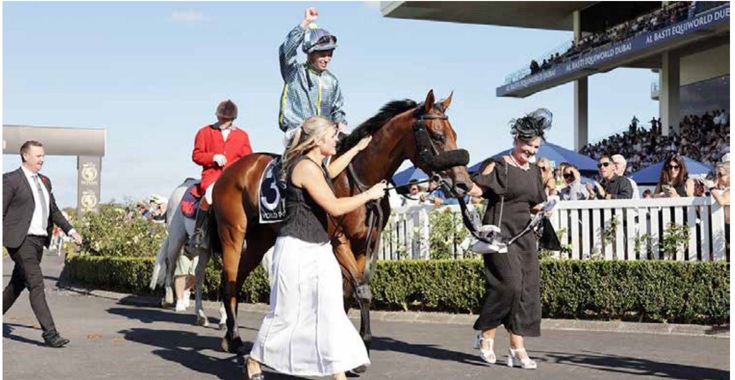
Road To Paris