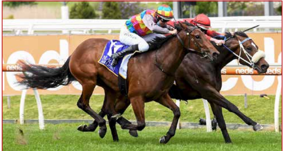
Kiki Express (near side)

There were four juvenile heats held at Randwick on Monday, with Parcae, a half-sister to Group 1 scorer Tentyris (Street Boss), landing his first trial at the third attempt. Finding the line