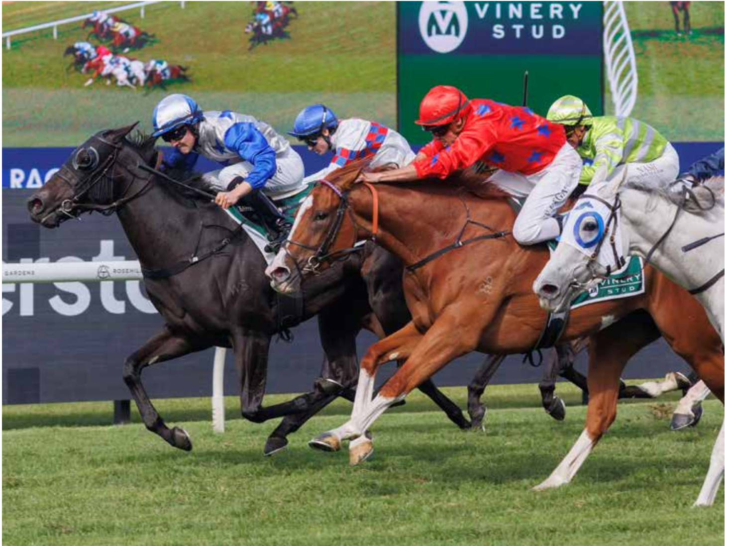
Belle Cheval (left)