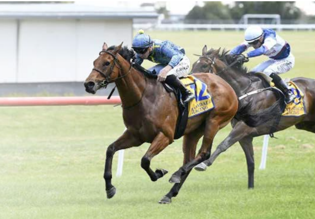
Road To Paris