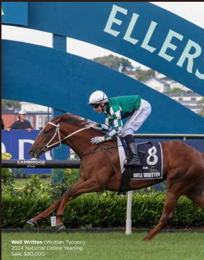
Well Written (Written Tycoon) 2024 National Online Yearling Sale, $80,000