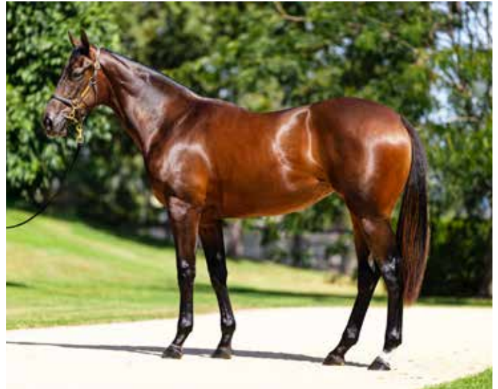
I Am Invincible ex Peace Time filly