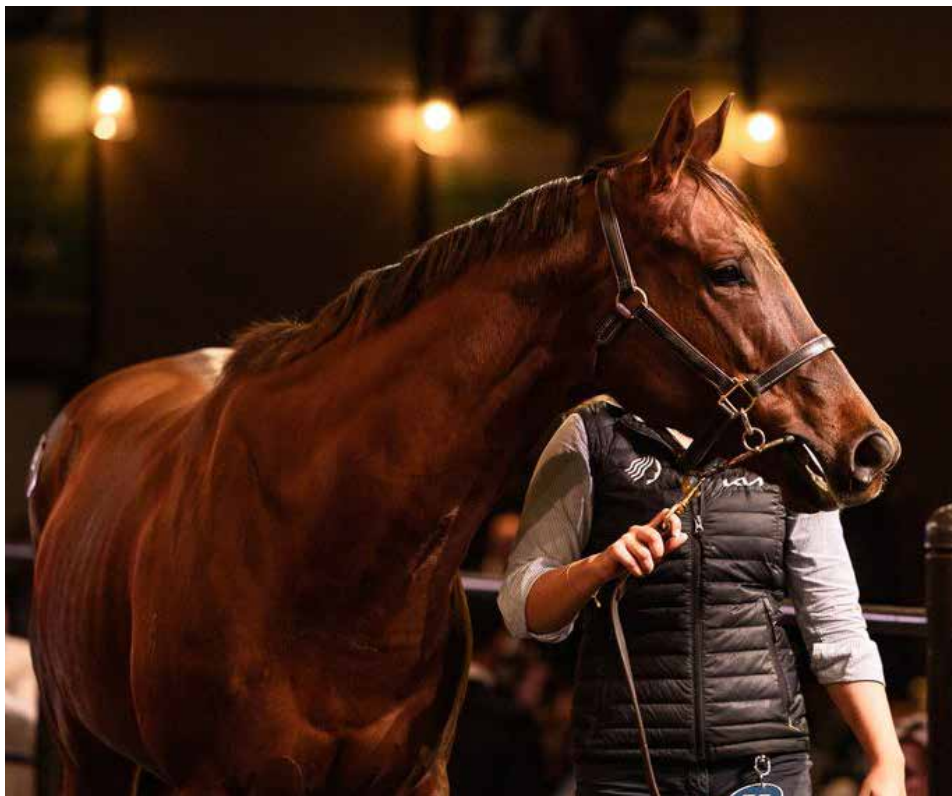
Bella Nipotina topped last year's Chairman's Sale

The auction will be held at Riverside Stables on the evening of Thursday, May 7 from 4pm and will again be held with a 'where elegance meets excellence' theme.