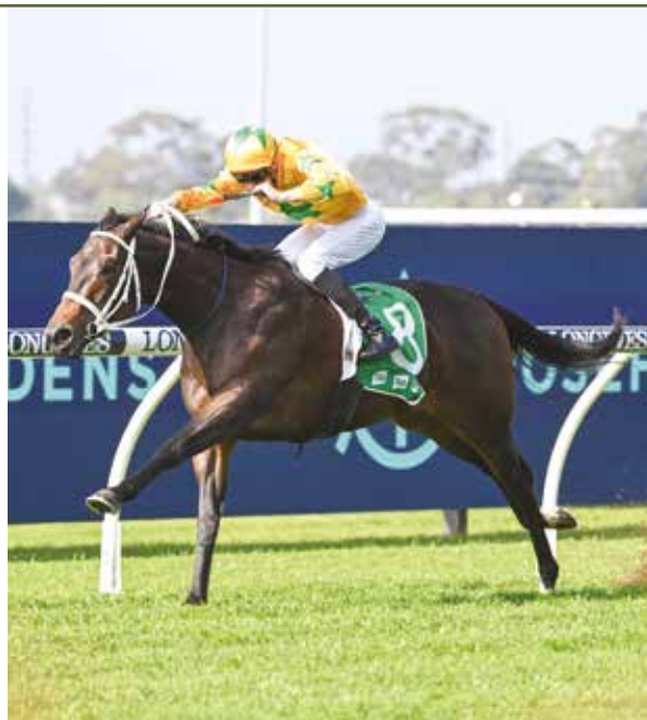
Tutta La Vita

The mare hails from a deep and active family, with close relations producing Group winners Hidden Motive (Capitalist), Enthaar (Written Tycoon) and Jasmin Rouge (Dundeel). Her siblings were covered by the likes of Zoustar (Northern Meteor) and Home Affairs (I Am Invincible) in 2025, while she also has an unraced two-year-old