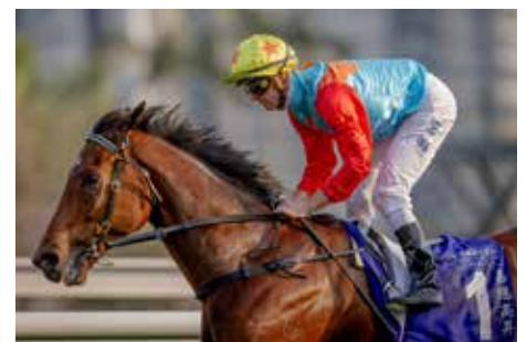
Ka Ying Rising