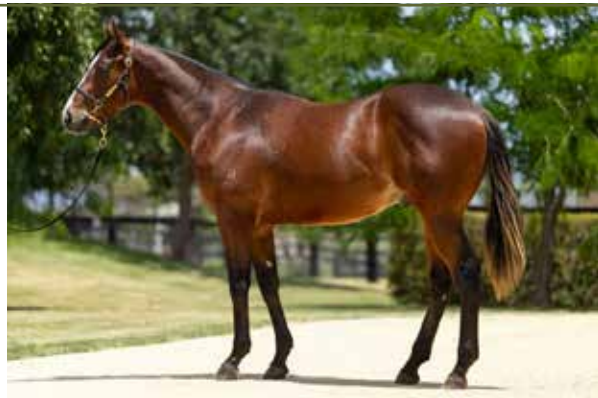
Nations League pictured as a yearling