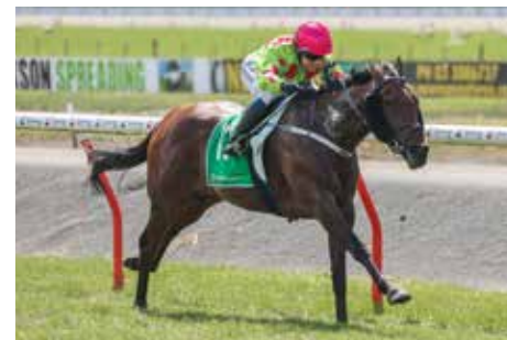
Queen Of Sheba