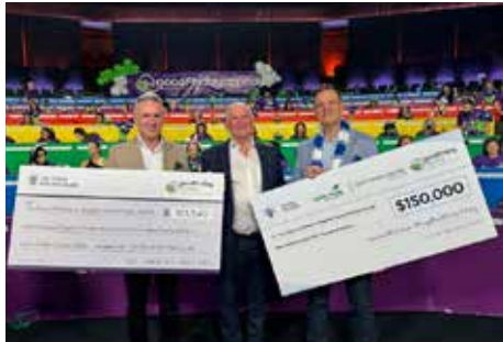
RV's donation to the Good Friday Appeal