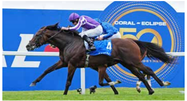
Delacroix wins the Group 1 Coral-Eclipse

That burst of acceleration was seen again to great effect in the Irish Champion Stakes (Gr 1, 1m 2f) at Leopardstown when Delacroix completed a double previously achieved by notable stallions like Sadler's Wells (Northern Dancer), Giant's Causeway (Storm Cat), Sea