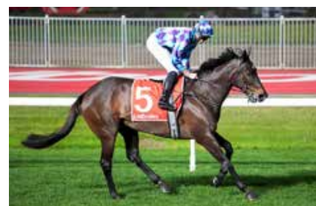
Pride Of Jenni