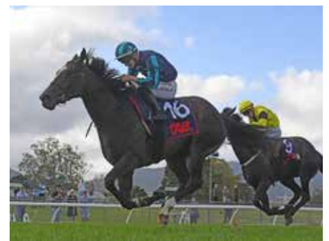
She's A Dealer