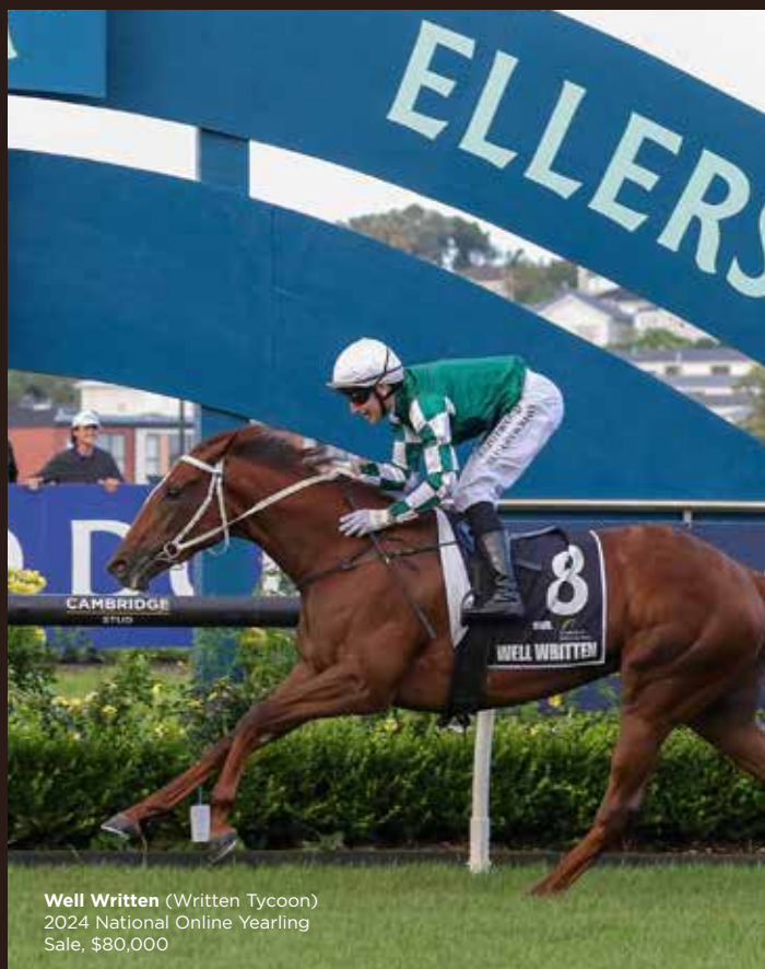
Well Written (Written Tycoon) 2024 National Online Yearling Sale, $80,000