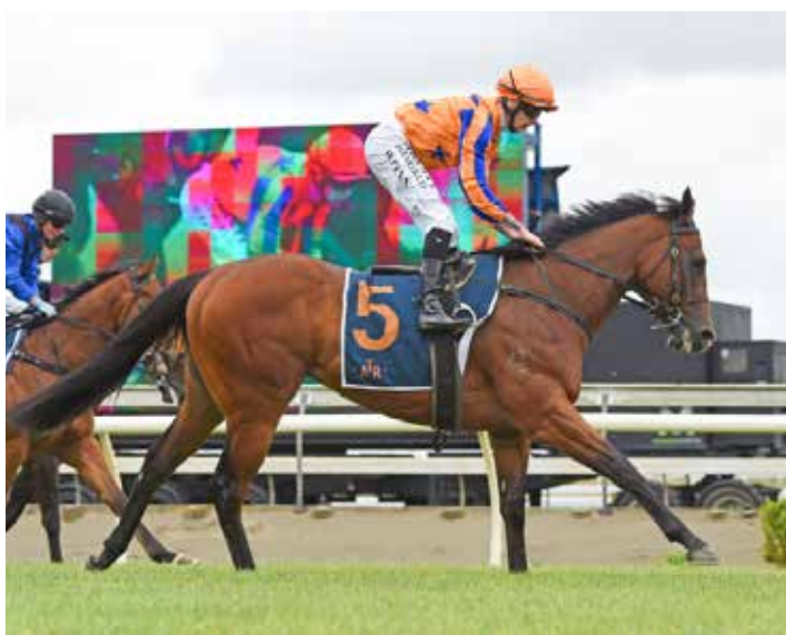
Return To Conquer

Banquo will stand for an increased fee of $5,000 (plus GST).