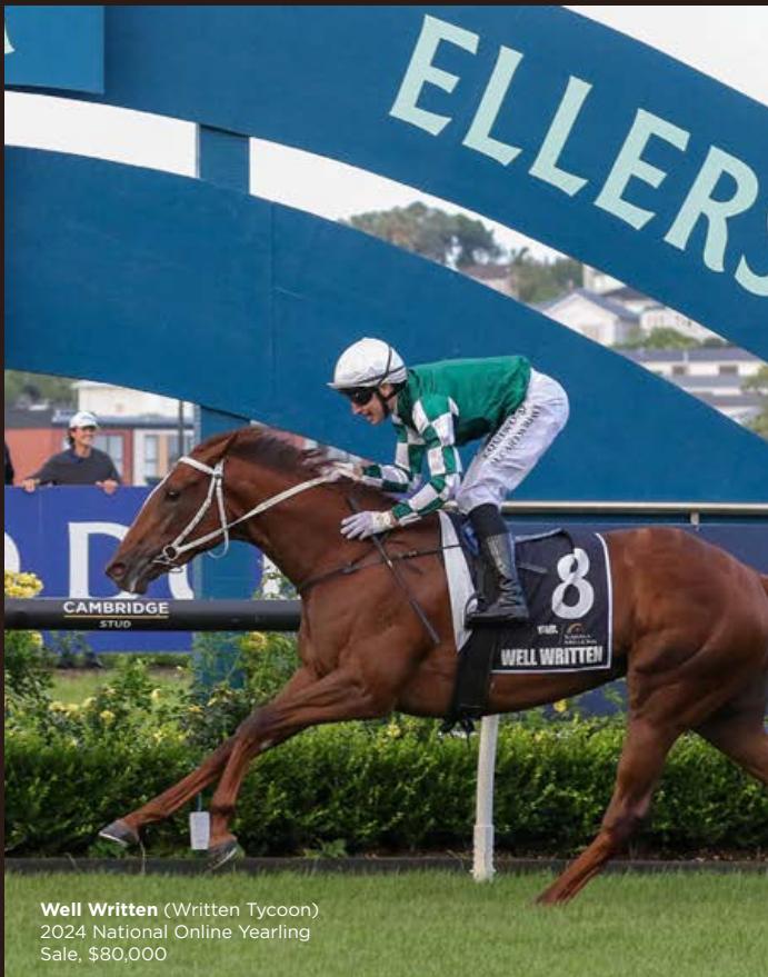
Well Written (Written Tycoon) 2024 National Online Yearling Sale, $80,000

through now. His progeny are probably mostly post-Christmas three-year-olds and onwards, which was when he hit his straps as a racehorse. Continued on page 4