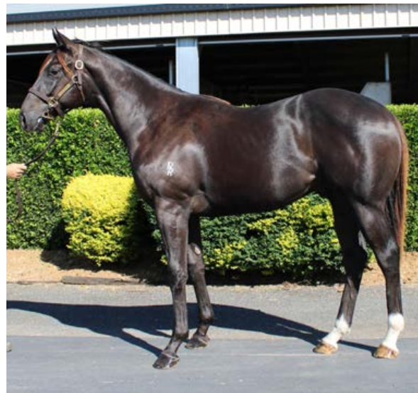
Lot 94: Dracarys ex Grey Mink colt

The son of Snitzel (Redoute's Choice) covered 65 mares in 2025 at a fee of $9,900 (inc GST), and has sired two stakes winners and 41 winners from 70 runners.