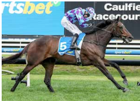
Pride Of Jenni