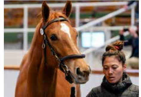
Starspangledbanner ex Belicious filly