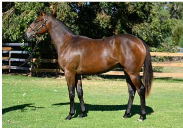
Lot 150: Wild Ruler ex Kiss In The Rain colt