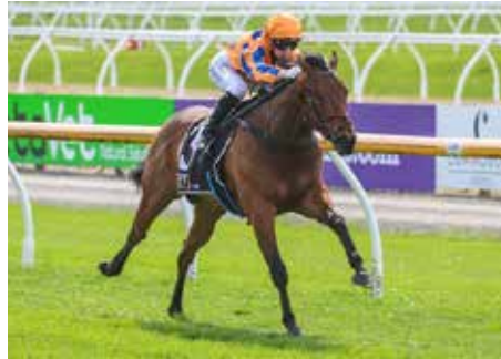
Out Of The Blue