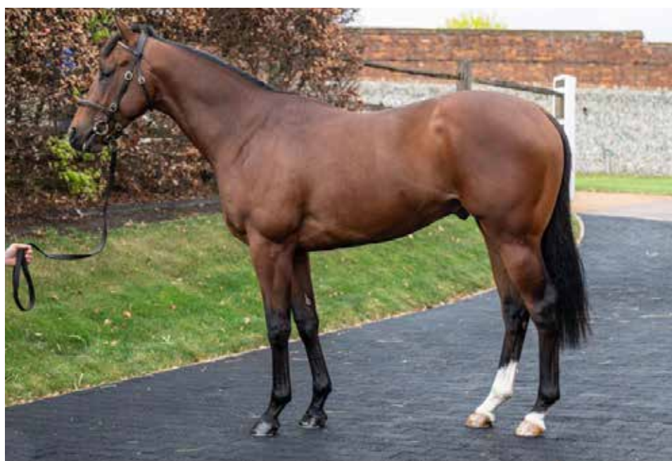
Lot 179: Justify ex Elitiste colt

The purchases highlight continued Australian demand at the Craven Sale, with buyers targeting a mix of proven international bloodlines.