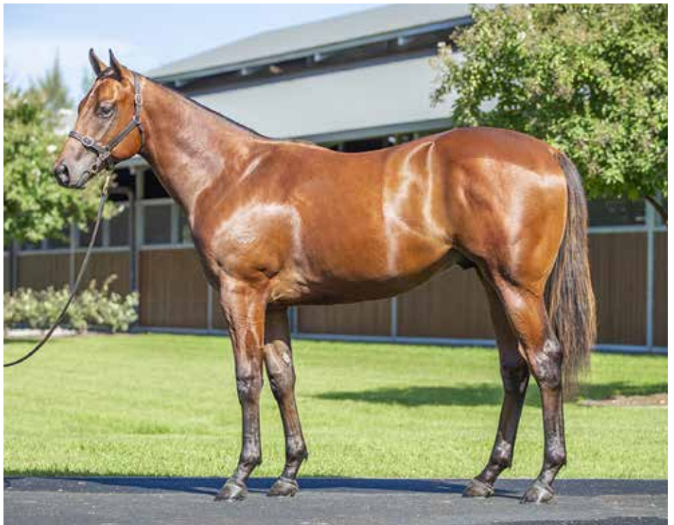
St Gotthard pictured as a yearling

Won: Kia Ora Bloodlines To Headlines Maiden Handicap, 1200m, April 15, Warwick Farm