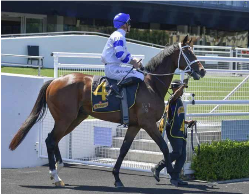
Vinery has a Supido half-brother to Sha Of Gomer (pictured) in the sale