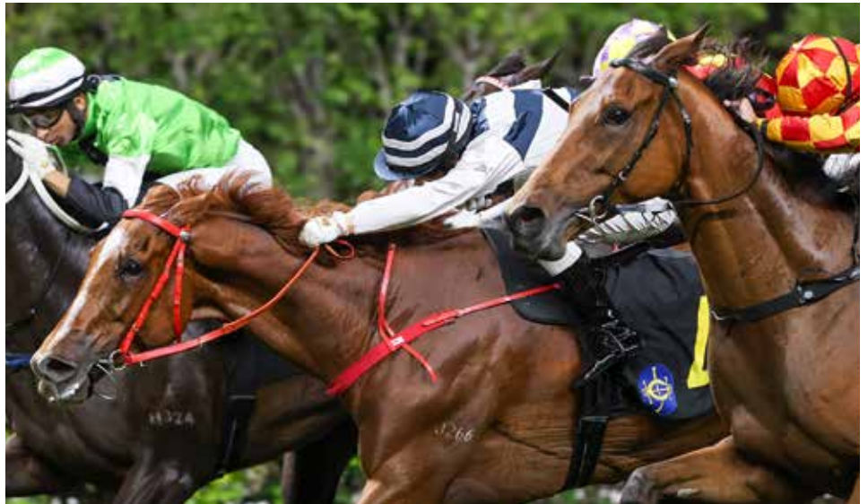
Harmony Galaxy (blue and white cap)

"It was a good performance, obviously being drawn wide [gate 12] was a concern beforehand but he's a horse who does go forward and he's got early speed, so we were