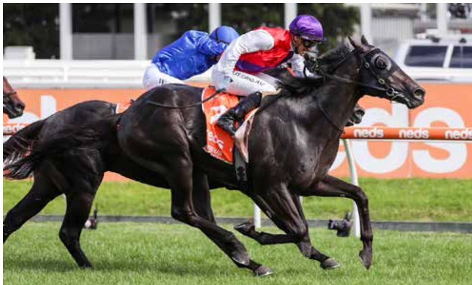
Kingstar Farm has a first-crop colt by Blue Diamond winner Artorius (pictured)