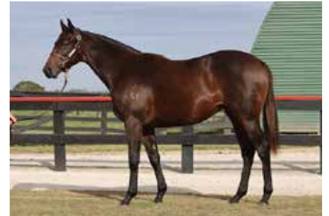
Lot 18: Sword Of State ex Sade filly NZB

Momentum from Karaka carried through to New Zealand Bloodstock's 2026 National Online Yearling Sale on Gavelhouse Plus, with 104 lots catalogued and more than $800,000 in turnover generated during Wednesday night's session. Leading the sale was Lot 18, a filly by Sword Of State (Snitzel) out of Sade (Savabeel), who was secured by Japanese buyer Golden Orchid Brothers Inc. for $70,000. Consigned by Curraghmore, the draft also featured Lot 29, a Satono Aladdin (Deep Impact) filly out of Tabata (Savabeel) purchased by Stephen Marsh Racing