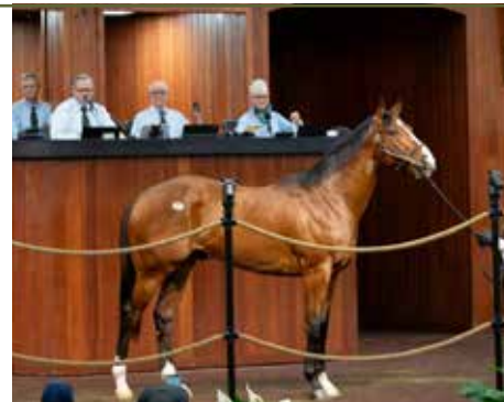
Flightline ex Lucrezia colt

The result confirmed the colt as the second-most expensive two-year-old ever sold in North America, trailing only the US$16 million The Green Monkey (Forestry)