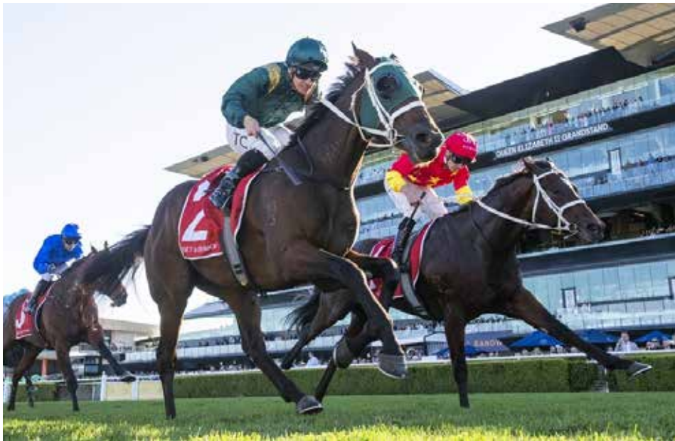
Fireball claims the Champagne Stakes at Randwick